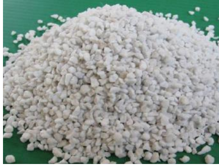
Ore Perlite in different sizes