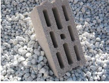
Pumice Wall Blocks

We have an extensive portfolio of successfully completed products. We have built our reputation on our client focus and pro-active approach. We are proud of the fact that the majority of our workload comes from repeat business and that we have a strong reputation for reliable execution of all projects undertaken. Some of our most important products are: