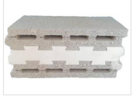
Self-Insulating Pumice Blocks