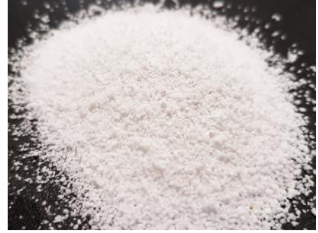
Expanded Perlite in different sizes