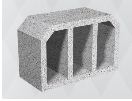
Pumice Masonry Units