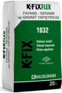
Block, Tile, Ceramic, Ranite Adhesives