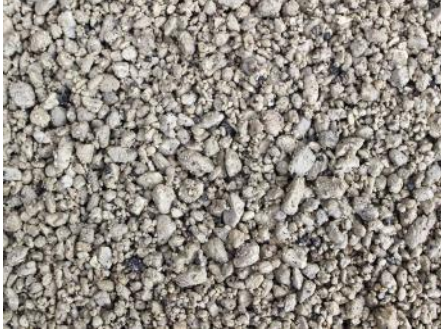
Ore or Expanded Pumice in different sizes