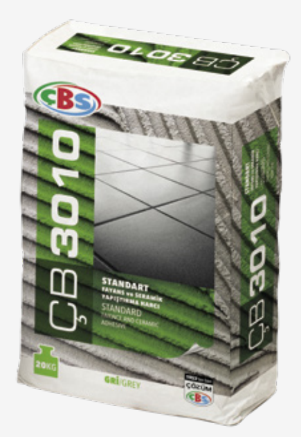
ÇB 3010 Tile & Ceramic Adhesive Standard