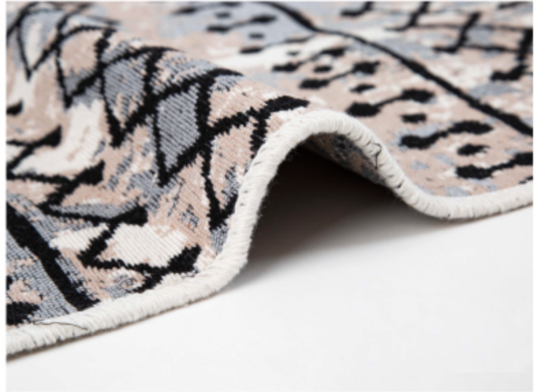
Recycled Rugs are soft on the eyes and to the touch, created with 100% recycled materials