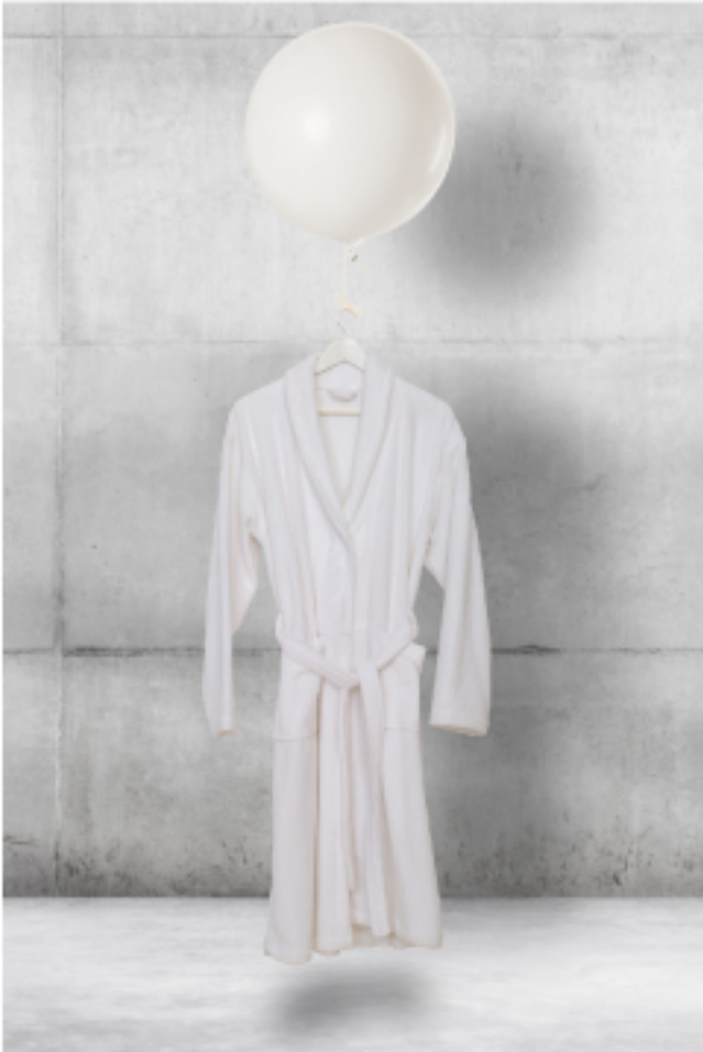
Microvelour, the lightest velour bathrobe on the planet

The earth – our products come from it, and Greenera aims to preserve it.