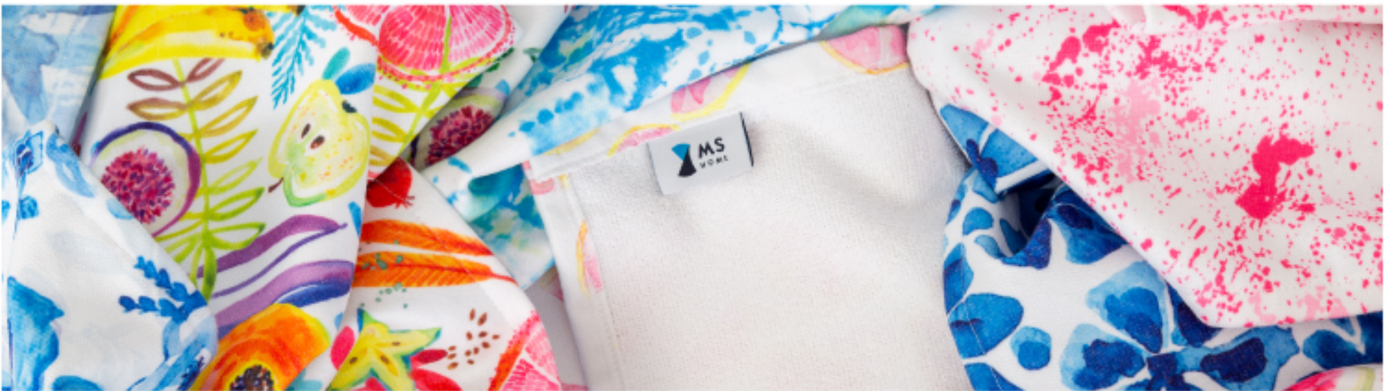
Two Sided quality is high absorbent, snag free, perfectly printed design