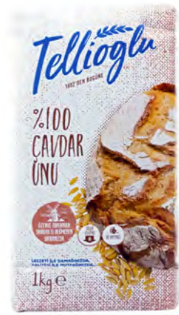
RYE FLOUR 1 KG