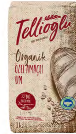
ORGANIC ALL PURPOSE FLOUR 1 KG