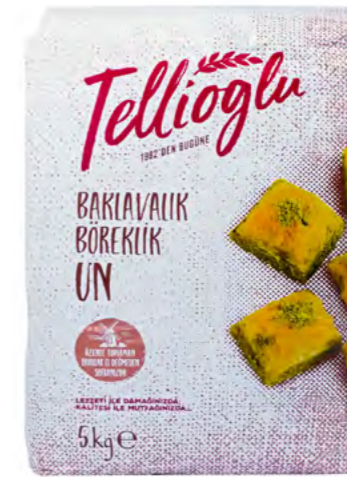
ALL PURPOSE FLOUR 5 KG