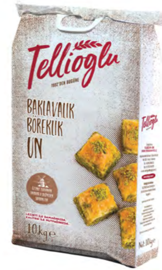
ALL PURPOSE FLOUR 10 KG

Weight : 25 KG - 50 KG Packing : PP / Kraft Protein : 13 % min. Moisture : 14 % max. Ash : 0.55 % max. Gluten : 33 % min.