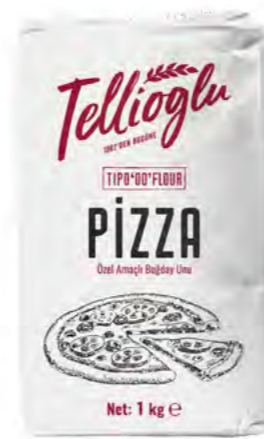
PIZZA FLOUR 1 KG