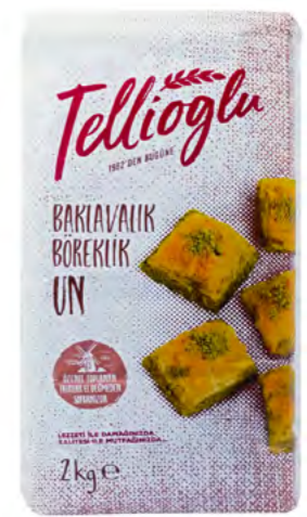
ALL PURPOSE FLOUR 2 KG