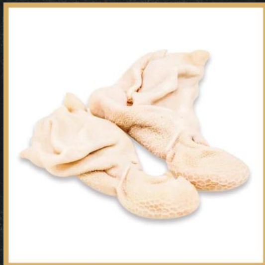
COOKED SHEEP TRIPE