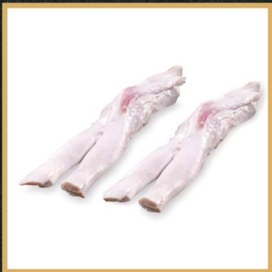
BEEF LEG TENDON