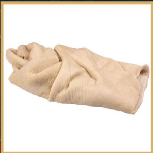
COOKED BEEF TRIPE