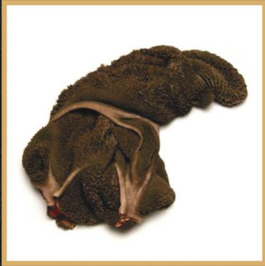
BEEF GREEN TRIPE