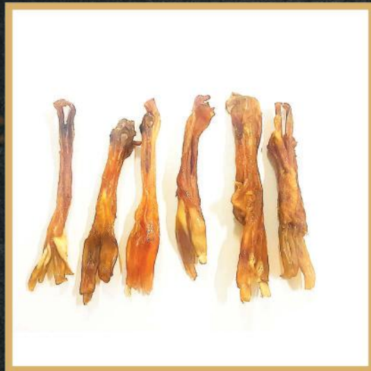
BEEF LEG TENDON