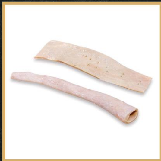
BEEF HEART VESSEL