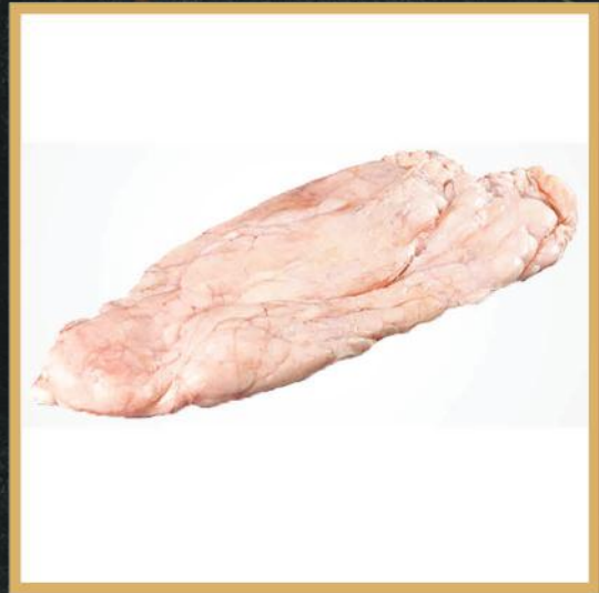
BEEF KIDNEY FAT