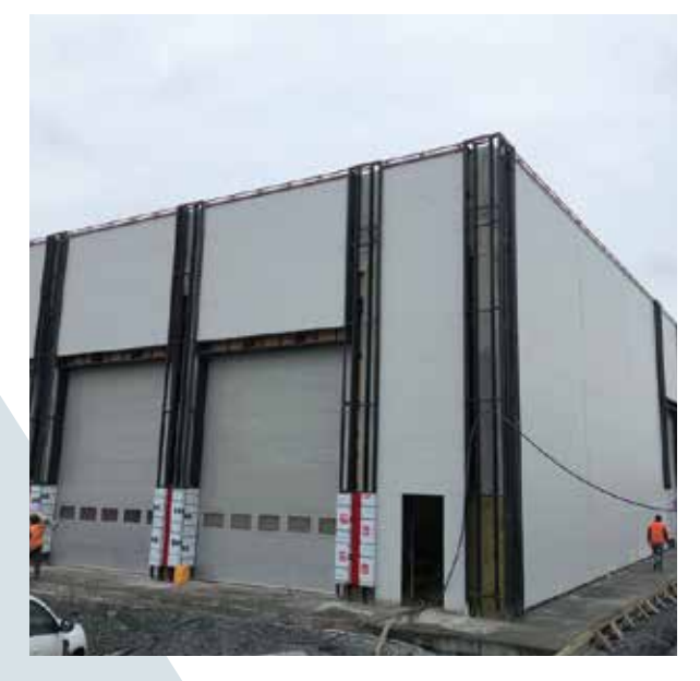
GALATAHAN OTEL 5 Outdoor Units, 62 Indoor Units Ventilation systems installation

ISTANBUL NEW AIRPORT 7 Outdoor Units, 60 Indoor Units