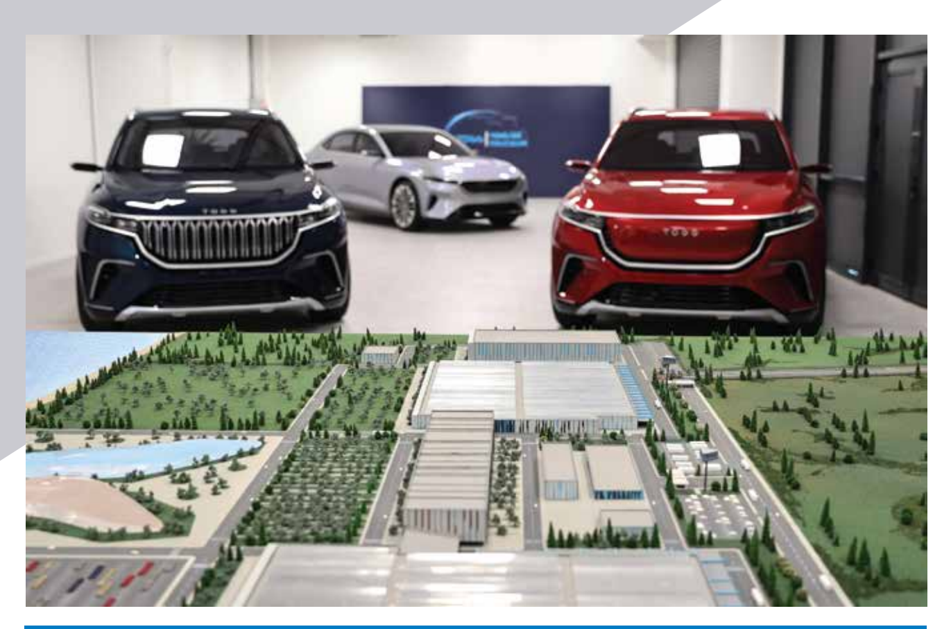
Treatment Plant - Prototype Workshop - Battery Building - Dining Halls