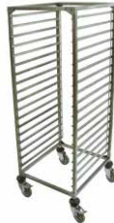
PASTRY TRAY TROLLEY PT604