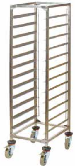
TRAY TROLLEY TT1112A