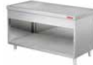
BTN706FN - BTN709FN BTN711FN - BTN714FN BTN718FN