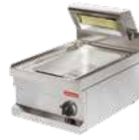
CHIPS SCUTTLE EPS604