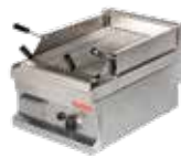
LAVA CHAR GRILL GGL604