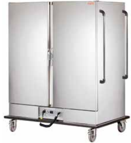
BANQUET TROLLEY BQ2