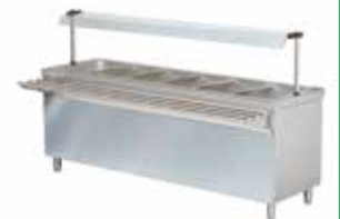
BAINMARIE UNIT ON OPEN CUPBOARD GN 6/1 BTEB721FN