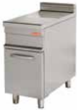
NEUTRAL UNIT N912D - N922D - N932D