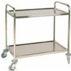
SERVICE TROLLEY WITH 2 SHELVES C102