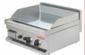
FRY TOP GG606 o - GG606 #