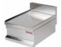
NEUTRAL UNIT N604P