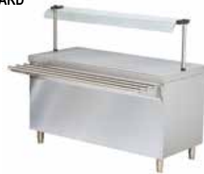
REFRIGERATED PLATE UNIT ON OPEN CUPBOARD BTCP718FN