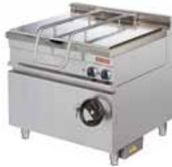
TILTING BRATT PAN EP922 - EP932