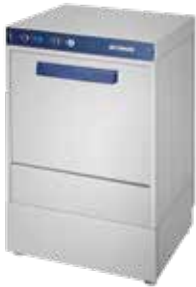
GLASS WASHER BW1200