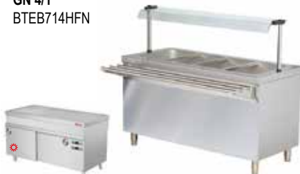
BAINMARIE UNIT ON HOT CUPBOARD GN 4/1 BTEB714HFN