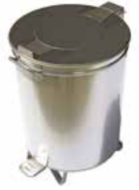
MOBILE REFUSE BIN WT95