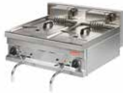
DEEP FAT FRYER EF721-S