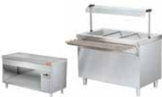
BAINMARIE UNIT ON OPEN CUPBOARD GN 3/1 BTEB711FN