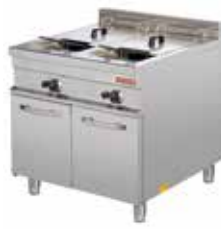
DEEP FAT FRYER EF922