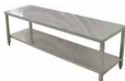
WORK TABLE T608-T612-T616-T620