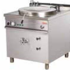
BOILING PAN EBP100I - EBP150I