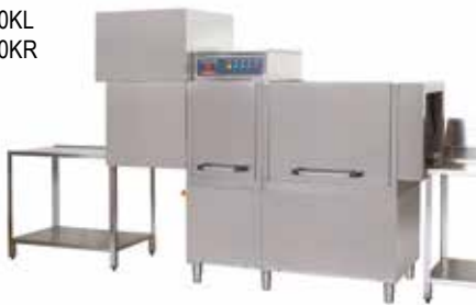
DISHWASHER DW2000KL DW2000KR