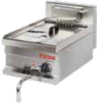
DEEP FAT FRYER EF711-S