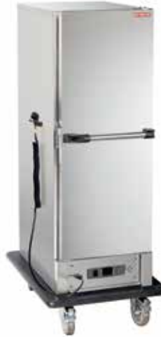
BANQUET TROLLEY BQ15N2