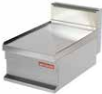
NEUTRAL UNIT N711P-S - N721P-S N731P-S