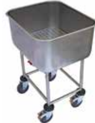
VEGETABLE WASHING TROLLEY MV68