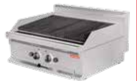
VAPOUR GRILL GW606