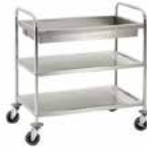
SERVICE TROLLEY WITH 2 SHELVES AND 1 DEEP CLEARING BASIN C103D