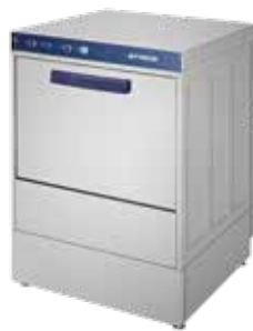
DISHWASHER DW 500N