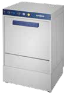
GLASS WASHER BW1200P