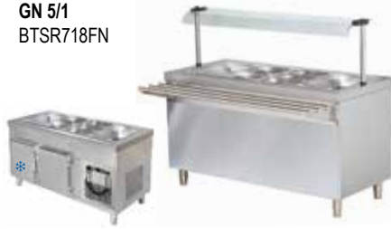
REFRIGERATED BOWL UNIT ON REFRIGERATED CUPBOARD GN 5/1 BTSR718FN