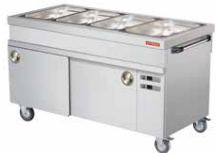
BAINMARIE WITH HOT CUPBOARD BTEB714HM