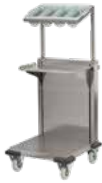
TRAY LIFTER MTCD55