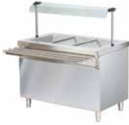
REFRIGERATED BOWL UNIT ON OPEN CUPBOARD GN 3/1 BTS711FN