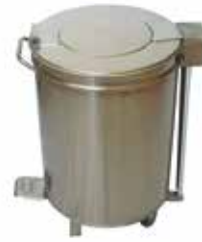
MOBILE REFUSE BIN WT48