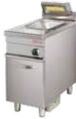
CHIPS SCUTTLE EPC912