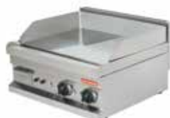
FRY TOP EG606SG o - EG606SG #