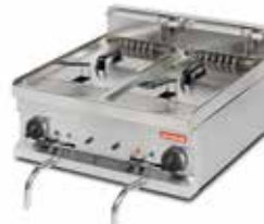
DEEP FAT FRYER EF606