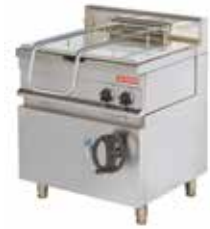
TILTING PAN EP722