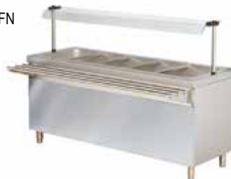
BAINMARIE UNIT ON HOT CUPBOARD GN 5/1 BTEB718HFN