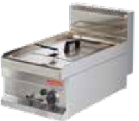
DEEP FAT FRYER GF604