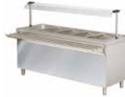
BAINMARIE UNIT ON OPEN CUPBOARD GN 5/1 BTEB718FN