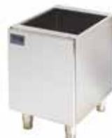
WORK TABLE WITH CUPBOARD D604D