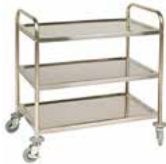
SERVICE TROLLEY WITH 3 SHELVES C103