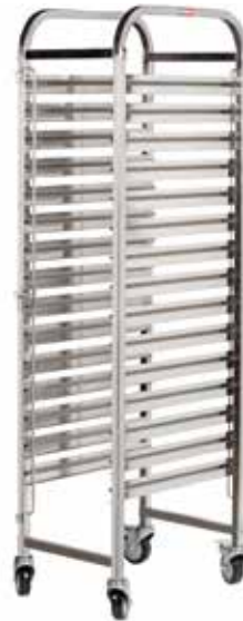
GN CONTAINER TROLLEY C115 - C215M1 - C215