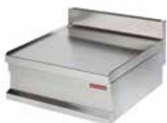
NEUTRAL UNIT N606P