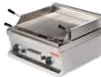
LAVA CHAR GRILL GGL606