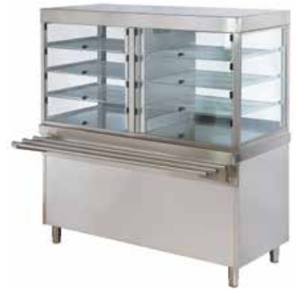
REFRIGERATED SHOWCASE ON OPEN CUPBOARD BTRS714FN