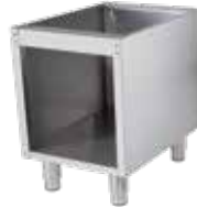
WORK TABLE WITH CUPBOARD D711 - D721 - D731