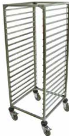
SELF SERVICE TRAY TROLLEY SLF30