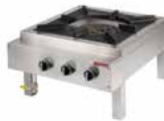
STOCK POT STOVE SPS706GTR