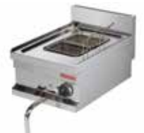
PASTA COOKER EMH604