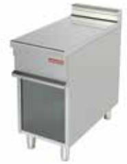
NEUTRAL UNIT N912 - N922 - N932