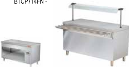
REFRIGERATED PLATE UNIT ON OPEN CUPBOARD BTCP714FN -