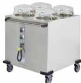
PLATE LIFTER (HEATED) HPL432