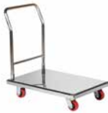
PLATFORM TROLLEY C609 (C501)