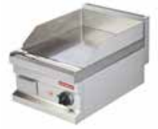
FRY TOP EG604 o - EG604 #