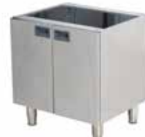
WORK TABLE WITH CUPBOARD D606D