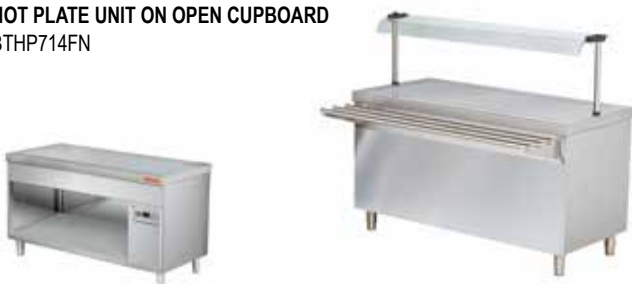
HOT PLATE UNIT ON OPEN CUPBOARD BTHP714FN