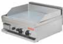
FRY TOP GG606SG o - GG606SG #