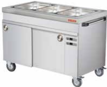
BAINMARIE WITH HOT CUPBOARD BTEB711HM