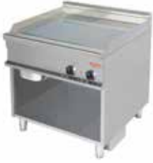
FRY TOP EG921SG o - EG921SG #