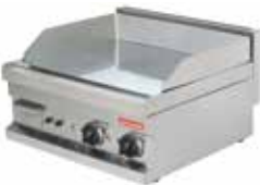
FRY TOP EG606 o - EG606 #