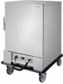
BANQUET TROLLEY BQ0