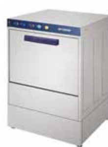
DISHWASHER DW 500NP