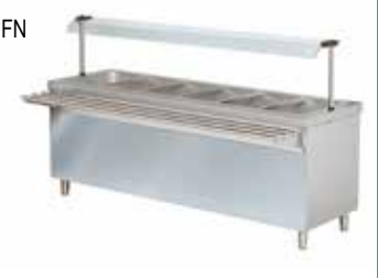
BAINMARIE UNIT ON HOT CUPBOARD GN 6/1 BTEB721HFN