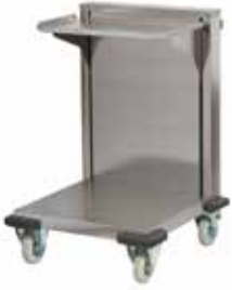
TRAY LIFTER MTR55