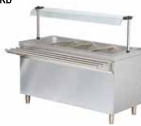
REFRIGERATED BOWL UNIT ON OPEN CUPBOARD GN 4/1 BTS714FN