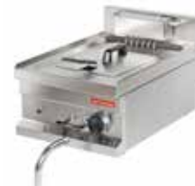
DEEP FAT FRYER EF604