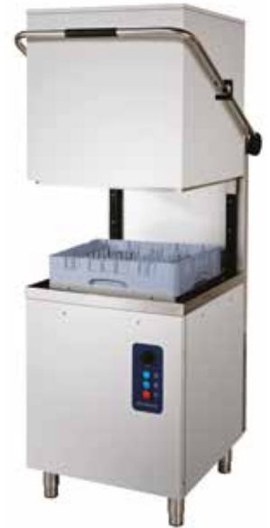
DISHWASHER DW1040TP DW1040TP D