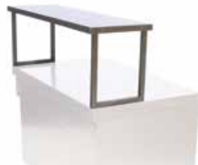
OVERSHELVES PGR060D - PGR090D PGR100D - PGR110D PGR115D - PGR120D PGR140D - PGR150D PGR160D - PGR180D PGR200D - PGR210D