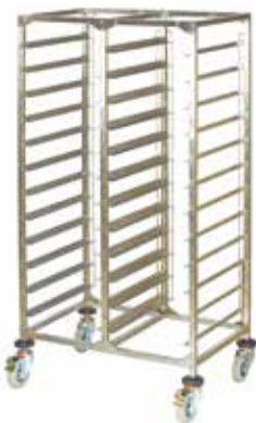
TRAY TROLLEY TT1212A