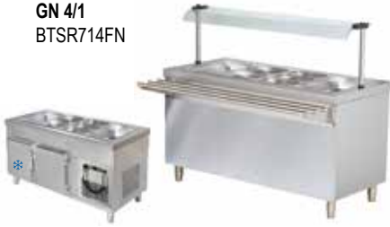
REFRIGERATED BOWL UNIT ON REFRIGERATED CUPBOARD GN 4/1 BTSR714FN