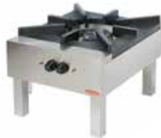
STOCK POT STOVE SPS706N - SPS706G