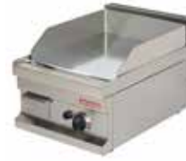
FRY TOP GG604 o - GG604 #