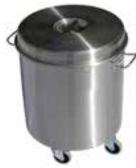
MOBILE REFUSE BIN WT50