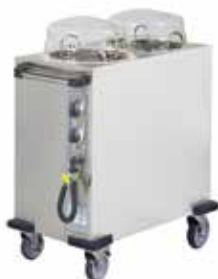
PLATE LIFTER (HEATED) HPL131 - HPL232