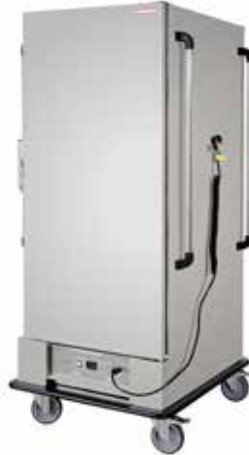
BANQUET TROLLEY BQ1N