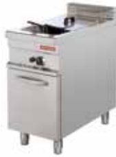
DEEP FAT FRYER EF912