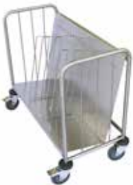
PLATE TROLLEY MCPL200