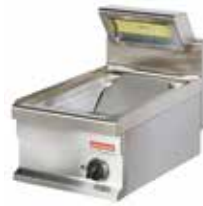
CHIPS SCUTTLE EPC711-S