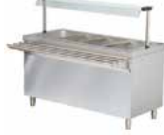
BAINMARIE UNIT ON OPEN CUPBOARD GN 4/1 BTEB714FN