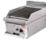
VAPOUR GRILL GW604