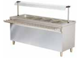
REFRIGERATED BOWL UNIT ON OPEN CUPBOARD GN 5/1 BTS718FN