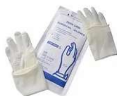
Sterile Latex Gloves