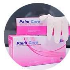
Nitrile and Latex Gloves