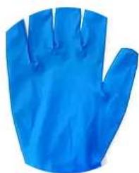
Nitrile Examination Gloves