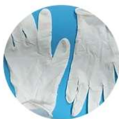
Powder-Free Latex Examination Gloves