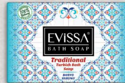
Traditional Turkish Bath Soap