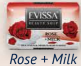
Rose + Milk