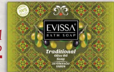
Traditional Olive Oil Bath Soap