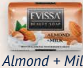
Almond + Milk