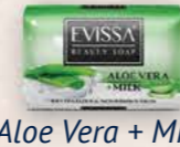
Aloe Vera + Milk