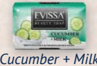
Cucumber + Milk