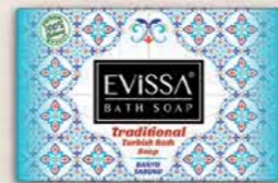
Traditional Bath Soap