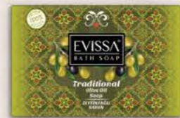
Traditional Olive Oil