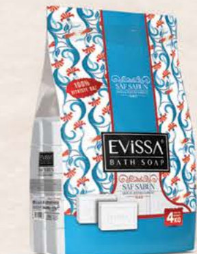
White Bath Soap