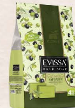
Green Bath Soap