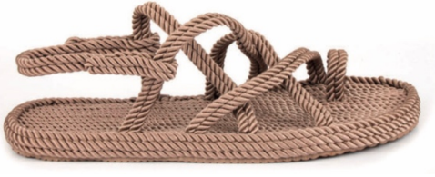
2-) Ürün Fotoğrafi.