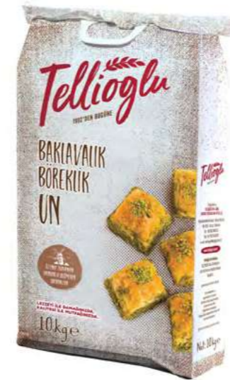
ALL PURPOSE FLOUR 10 KG

Weight : 25 KG - 50 KG Packing : PP / Kraft Protein : 13 % min. Moisture : 14 % max. Ash : 0.55 % max. Gluten : 33 % min.