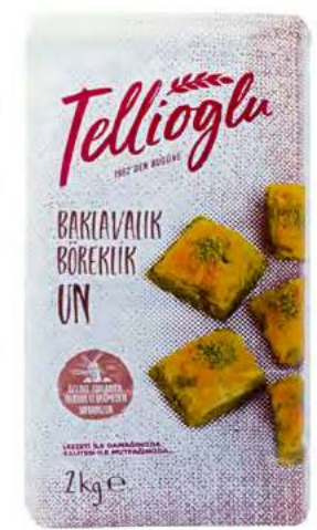
ALL PURPOSE FLOUR 2 KG