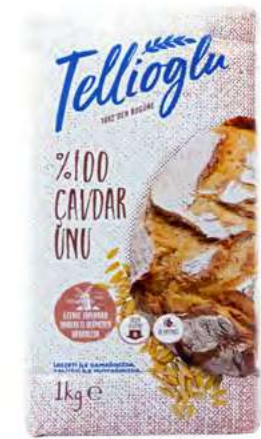
RYE FLOUR 1 KG