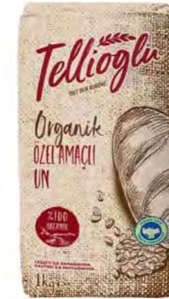
ORGANIC ALL PURPOSE FLOUR 1 KG