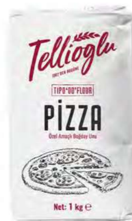
PIZZA FLOUR 1 KG