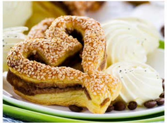
Sesame for Bakery