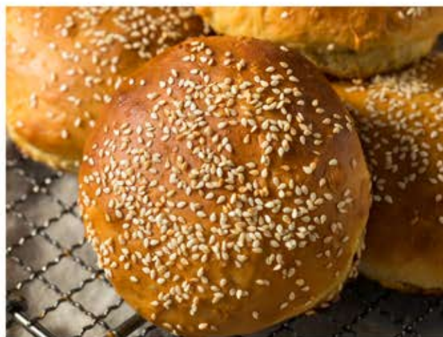
Sortex and Incombustible Sesame