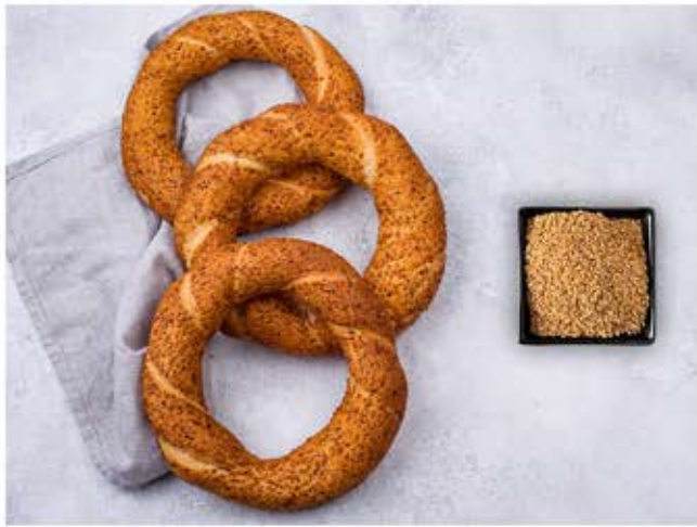
Sesame for Bagels