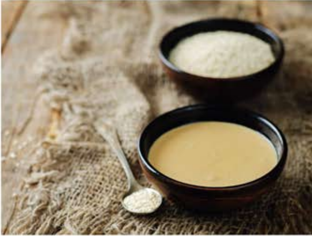
CTS Natural Tahini

Packing: 350/600/1000gr Glass Jar | 10/30kg Plastic Box