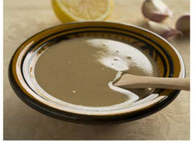
CTS Double Baked Tahini

CTS Natural Tahini is produced to meet worldwide export requirements and delivered to you after pasteurizing.