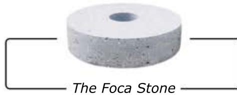
The Foca Stone

CTS uses a special millstone for tahini production. Classic mills use flintstones and it gives a bitter taste to tahini. The special Foca Stone we use protects the original taste and doesn't burn the tahini.