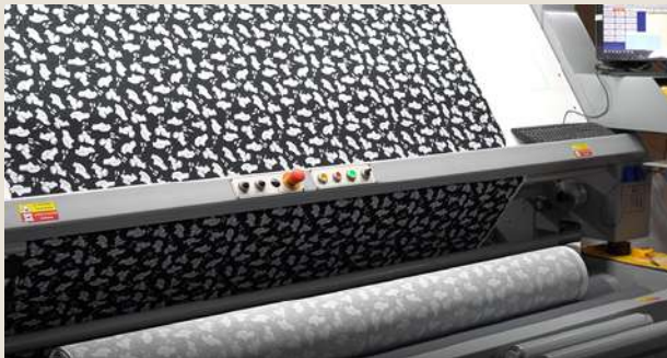
Fabric Quality Control Machine

Our company has all the facilities including Design Team, Pattern Room, Sampling, Cutting, Packaging. We have our own QA control system with in-house QC team.