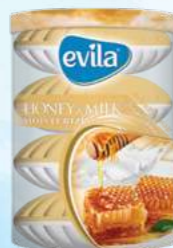
Honey & Milk