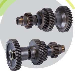
Heavy Vehicles Gears Spare Parts