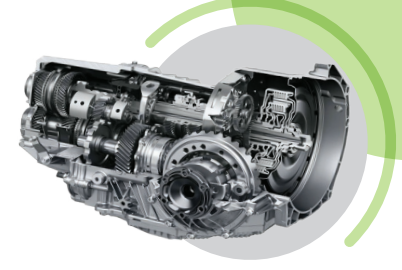
Speacial Gearbox Spare Parts