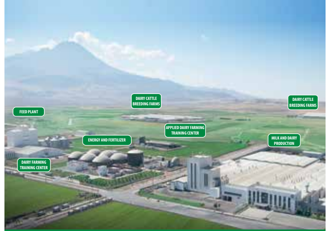
SÜTAŞ AKSARAY INTEGRATED FACILITIES