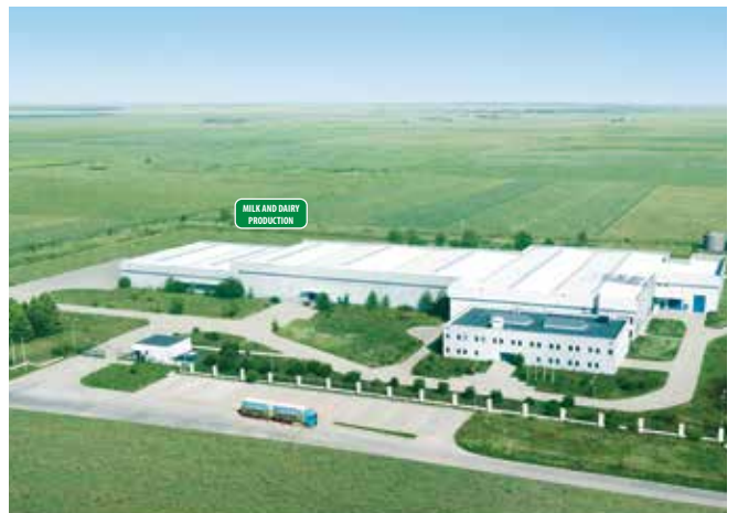
SÜTAŞ ROMANIA BUCHAREST FACILITIES