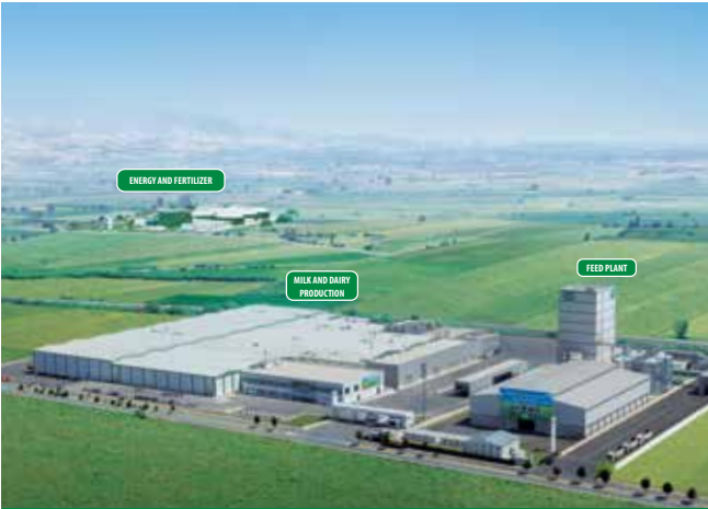
SÜTAŞ TİRE INTEGRATED FACILITIES