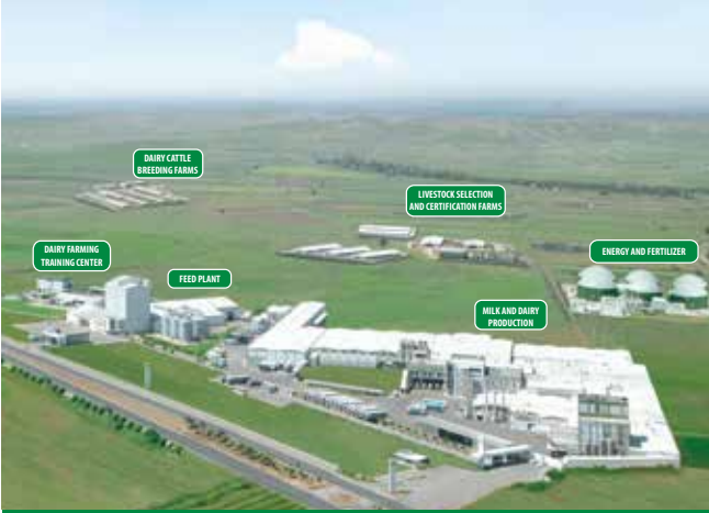
SÜTAŞ KARACABEY INTEGRATED FACILITIES