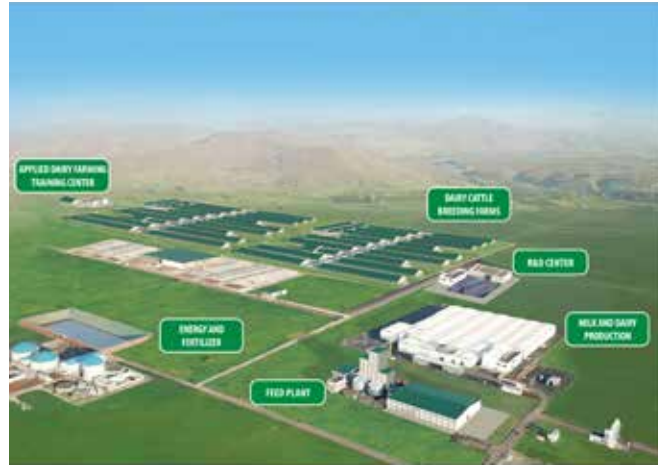
SÜTAŞ BİNGÖL INTEGRATED FACILITIES