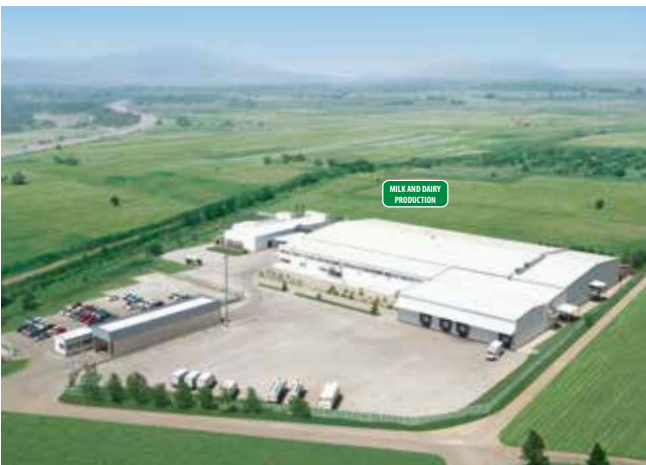
SÜTAŞ NORTHERN MACEDONIA SKOPJE FACILITIES