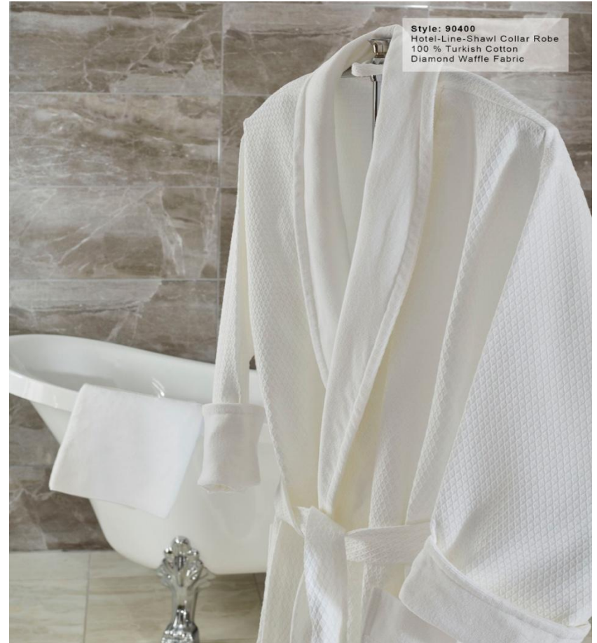
Style: 90400 Hotel-Line-Shawl Collar Robe 100 % Turkish Cotton Diamond Waffle Fabric