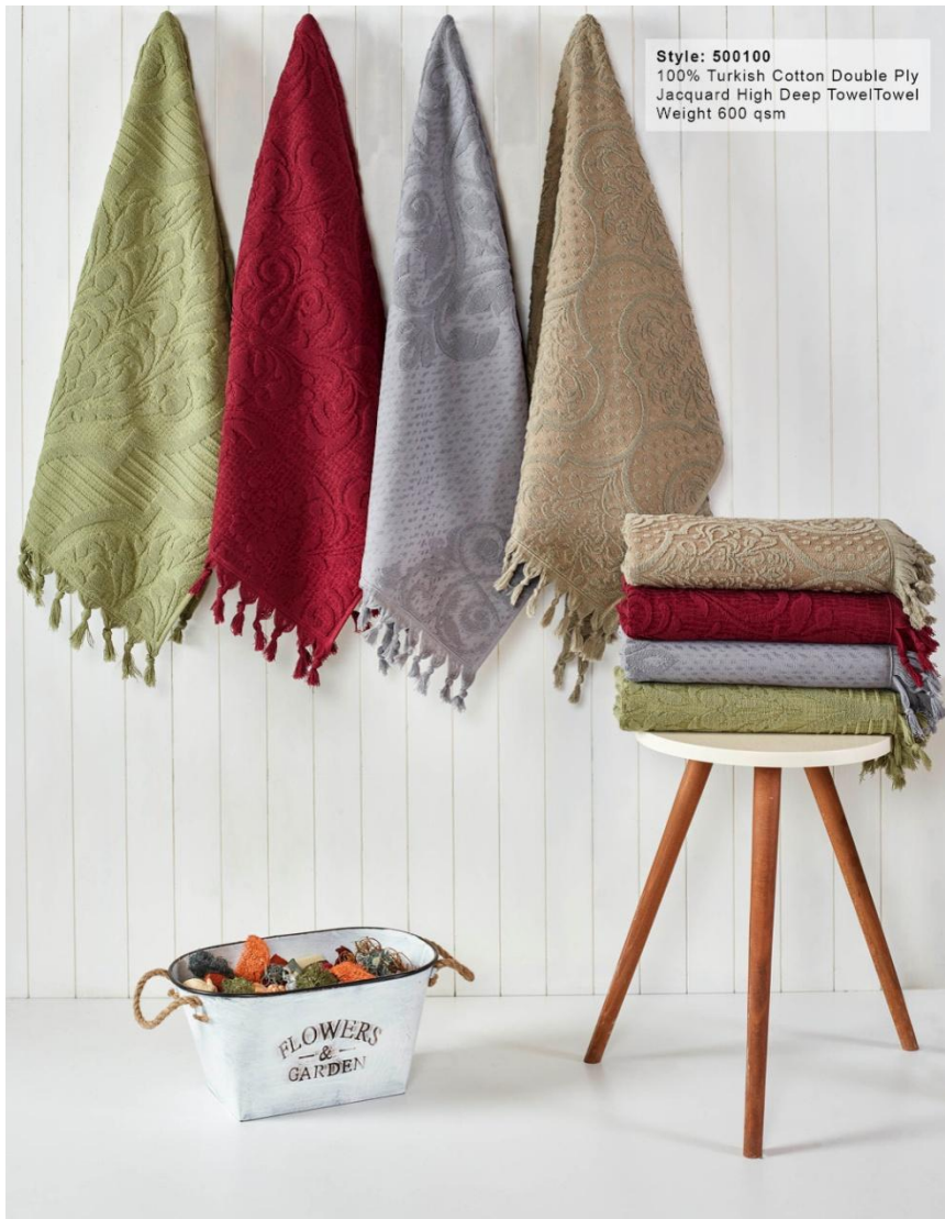
Style: 500100 100% Turkish Cotton Double Ply Jacquard High Deep Towel Weight 600 qsm