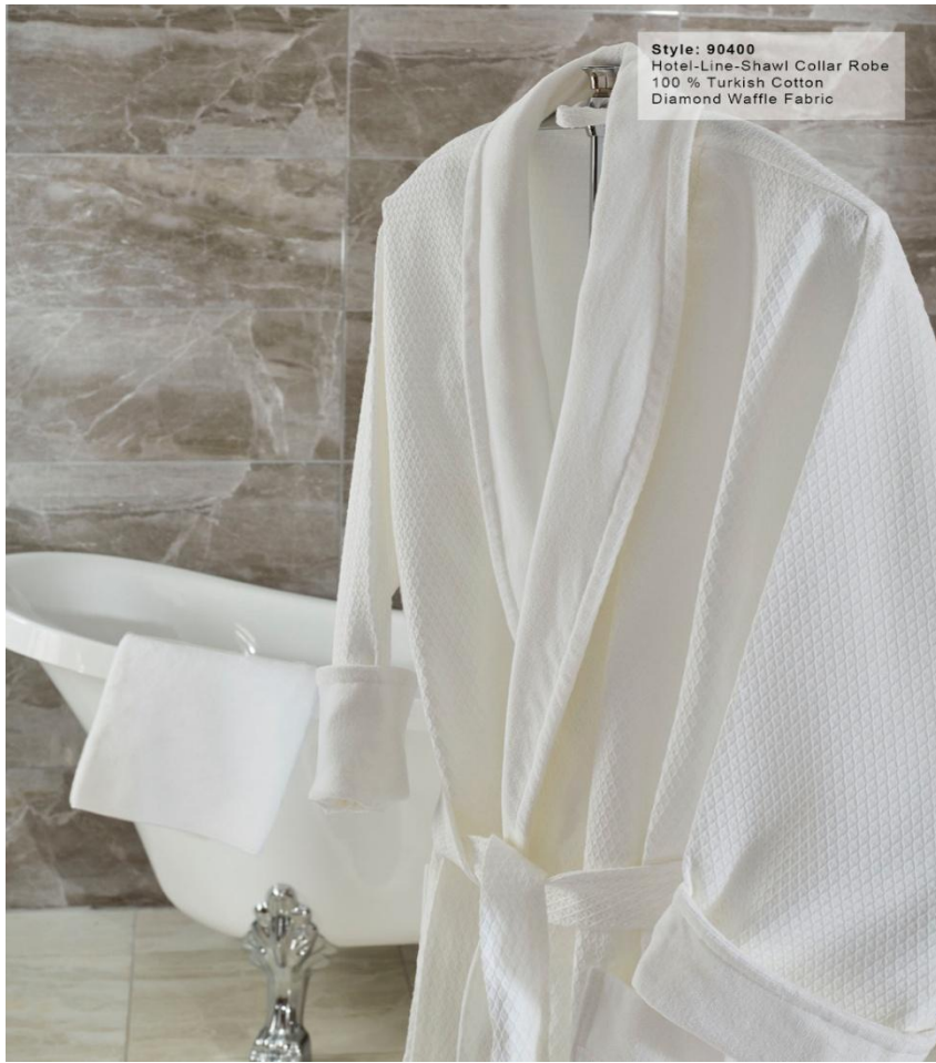
Style: 90400 Hotel-Line-Shawl Collar Robe 100 % Turkish Cotton Diamond Waffle Fabric