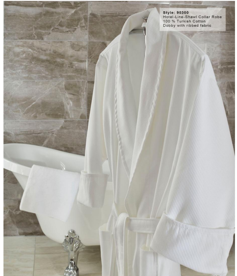
Style: 90300 Hotel-Line-Shawl Collar Robe 100 % Turkish Cotton Dobby with ribbed fabric