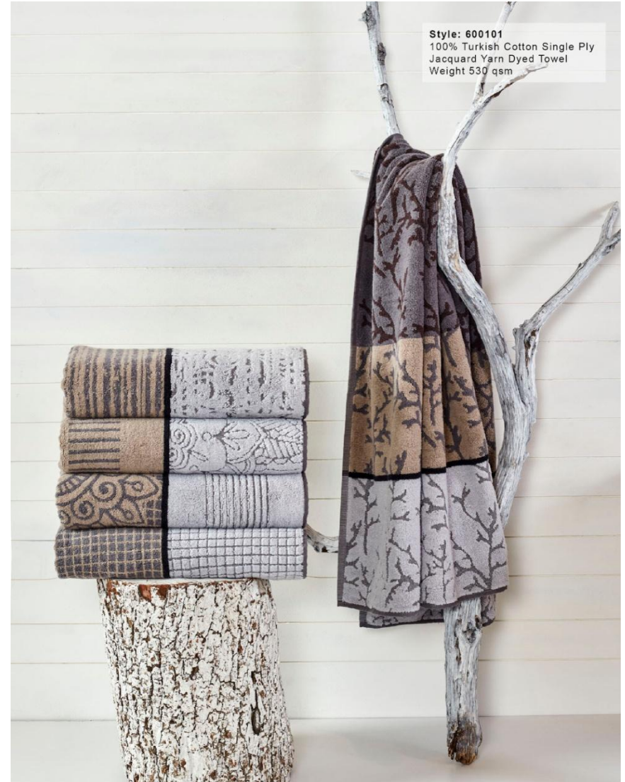
Style: 600101 100% Turkish Cotton Single Ply Jacquard Yarn Dyed Towel Weight 530 qsm