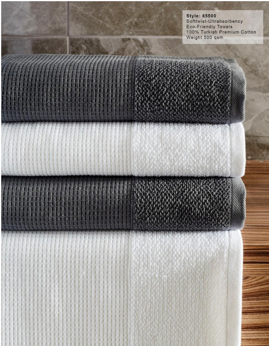
Style: 85500 Softtwist-Ultrabsorbency Eco-Friendly Towels 100% Turkish Premium Cotton Weight 500 qsm