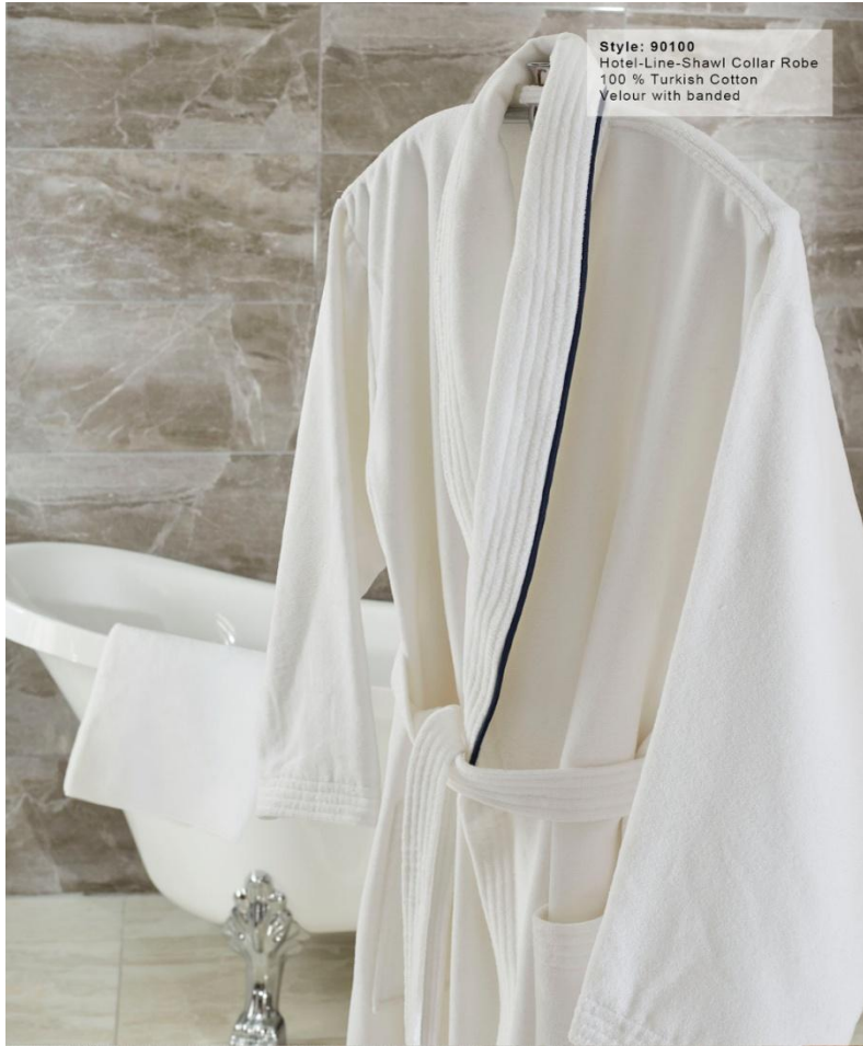
Style: 90100 Hotel-Line-Shawl Collar Robe 100 % Turkish Cotton Velour with banded