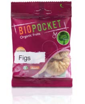
50 gr (1.76 oz) Pillow Bag