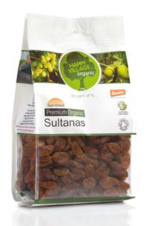
200 gr - 500 gr Quadro Bag