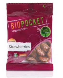
50 gr (1.76 oz) Pillow Bag