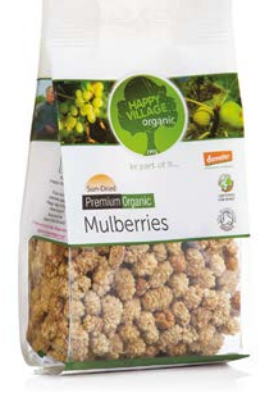
200 gr - 500 gr Quadro Bag