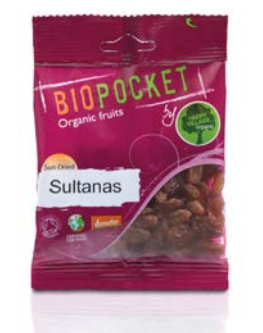
50 gr (1.76 oz) Pillow Bag