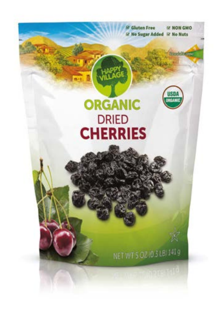
141 gr (5 oz) - 454 gr (16 oz) Doypack