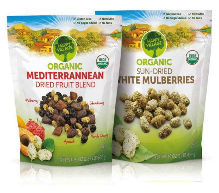
141 gr (5 oz) - 454 gr (16 oz) Doypack