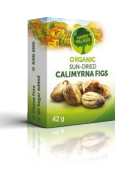
42 gr (1.48 oz) Lunch Box

Western Anatolia, city of Aydın Number of Happy Villages: 30