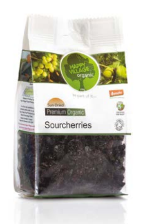
200 gr - 500 gr Quadro Bag