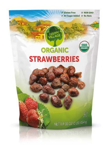
141 gr (5 oz) - 454 gr (16 oz) Doypack