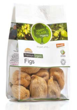
200 gr - 500 gr Quadro Bag