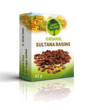
42 gr (1.48 oz) Lunch Box

Western Anatolia, cities of İzmir & Manisa Number of Happy Villages: 25