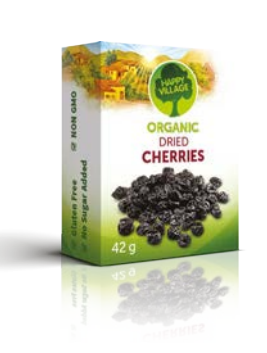
42 gr (1.48 oz) Lunch Box

Western Anatolia, city of Afyon Number of Happy Villages: 15