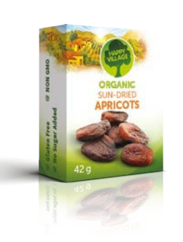
42 gr (1.48 oz) Lunch Box

Eastern Anatolia, city of Malatya Number of Happy Villages: 21