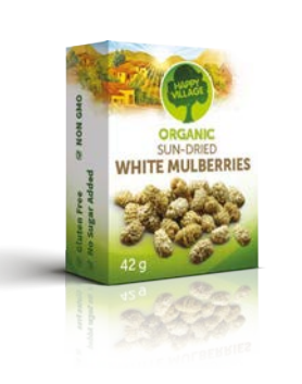
42 gr (1.48 oz) Lunch Box

Marmara, Western, Central & Eastern Anatolia, city of Bursa, Konya, Afyon, Elazig & Malatya Number of Happy Villages: 3