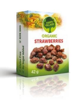
42 gr (1.48 oz) Lunch Box

Marmara & Central Anatolia, cities of Bursa & Konya Number of Happy Villages: 11