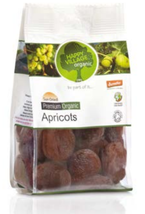
200 gr - 500 gr Quadro Bag