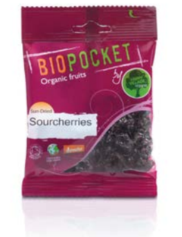
50 gr (1.76 oz) Pillow Bag