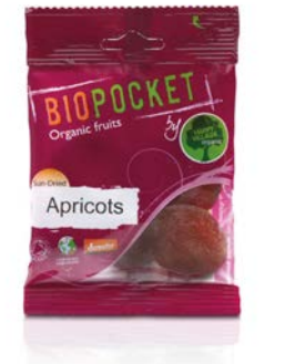
50 gr (1.76 oz) Pillow Bag