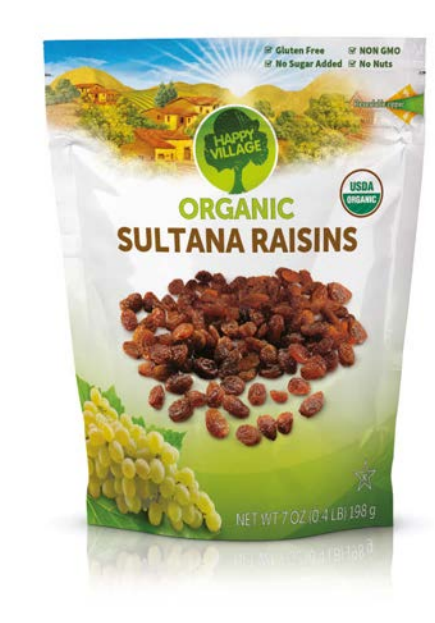
141 gr (5 oz) - 454 gr (16 oz) Doypack