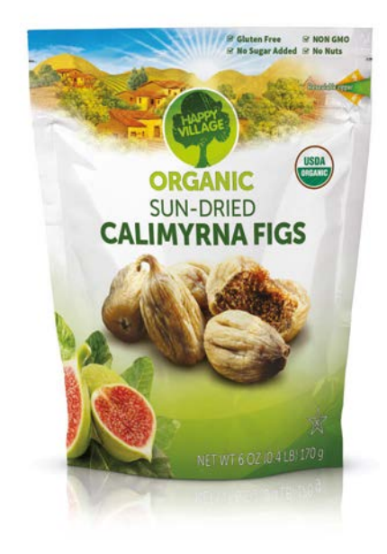
170 gr (6 oz) - 1.13 kg (40 oz) Doypack