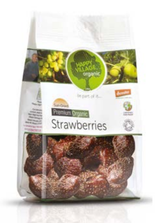
200 gr - 500 gr Quadro Bag