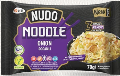
Onion 70 Grams x 40 Pieces (1 Box)