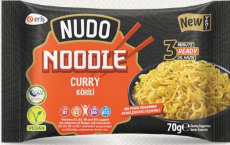
Curry 70 Grams x 40 Pieces (1 Box)