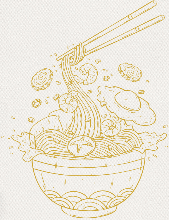
Chicken Flavor 60 Grams x 24 Pieces (1 Box)