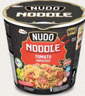
Tomato 60 Grams x 24 Pieces (1 Box)