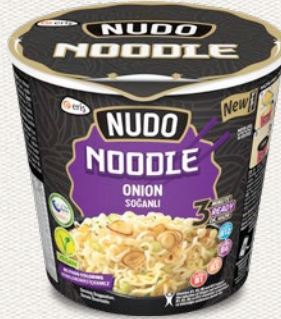
Onion 60 Grams x 24 Pieces (1 Box)