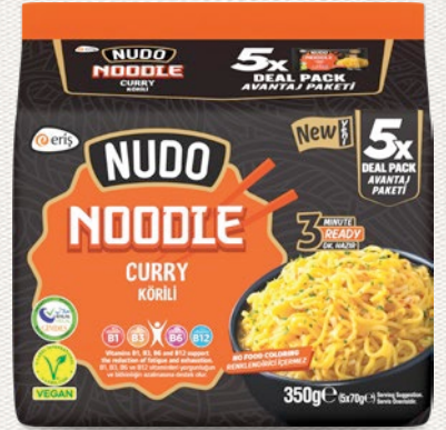
Curry 350 Grams x 8 Pieces (1 Box)