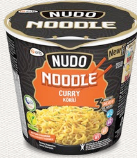
Curry 60 Grams x 24 Pieces (1 Box)