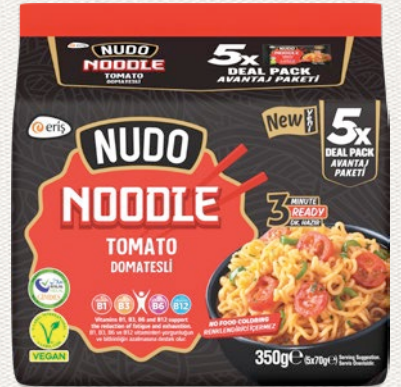
Tomato 350 Grams x 8 Pieces (1 Box)