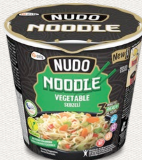
Vegetable 60 Grams x 24 Pieces (1 Box)