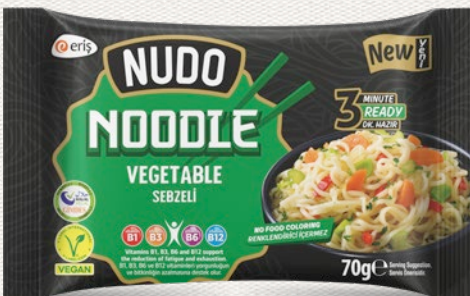
Vegetable 70 Grams x 40 Pieces (1 Box)