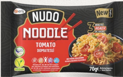
Tomato 70 Grams x 40 Pieces (1 Box)