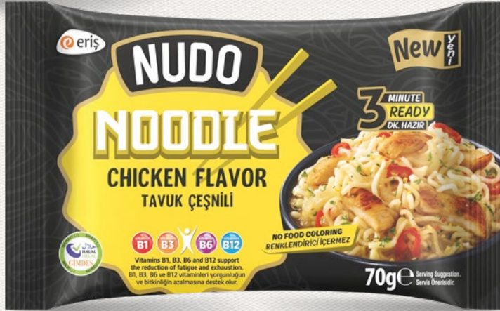
Chicken Flavor 70 Grams x 40 Pieces (1 Box)