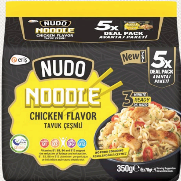
Chicken Flavor 350 Grams x 8 Pieces (1 Box)