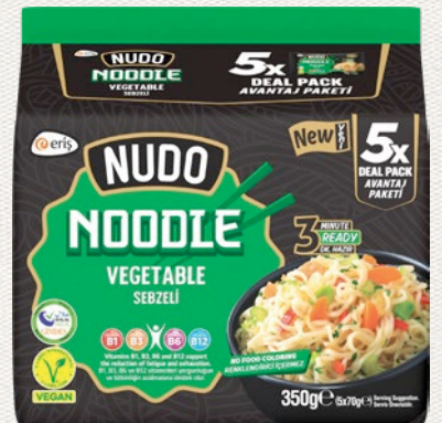
Vegetable 350 Grams x 8 Pieces (1 Box)