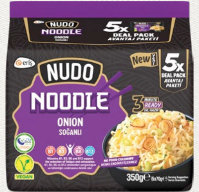
Onion 350 Grams x 8 Pieces (1 Box)