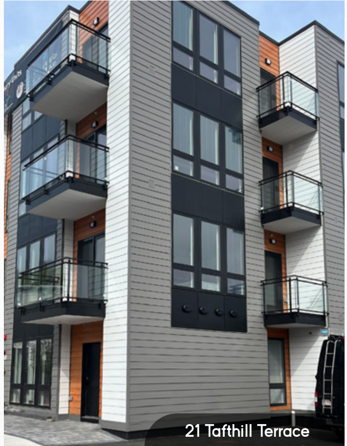
21 Taffhill Terrace