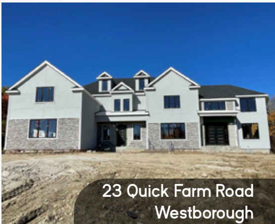
23 Quick Farm Road Westborough