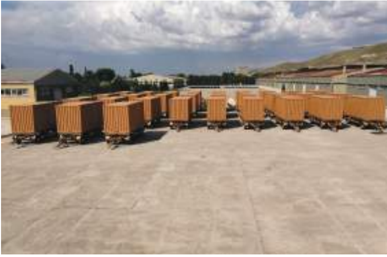
TRAILER MOUNTED ISO TYPE SHOWER AND WC CONTAINERS Türkiye