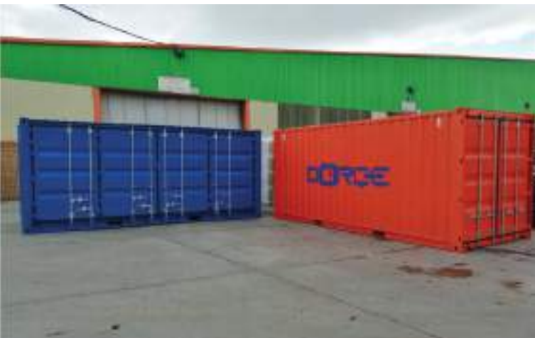
ISO CONTAINERS Türkiye