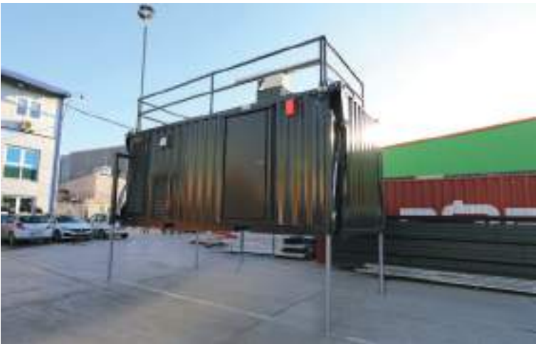
SELF LIFTING SHELTER Türkiye