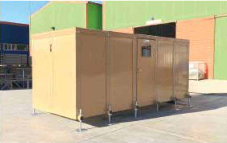
AIRPORTABLE MILITARY CONTAINERS BARRACKS, CLINIC, SHOWER, WC WITH GENERATOR AND SOLAR SYSTEM Türkiye