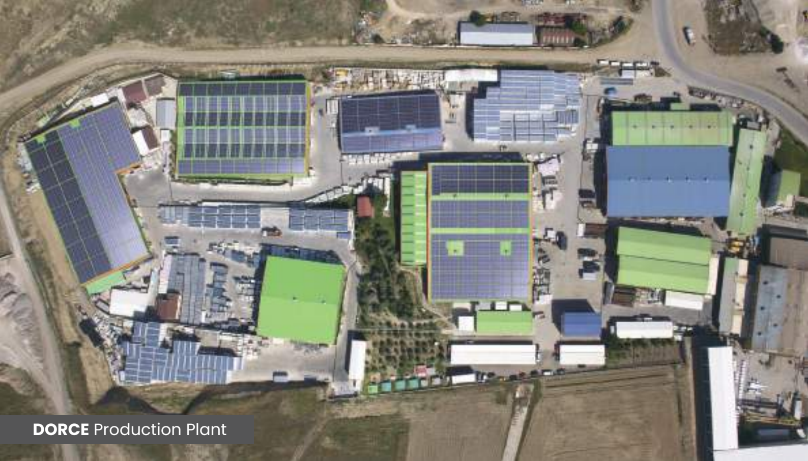
DORCE Production Plant

DORCE completes prefabricated modular steel structures towards meeting all kinds of needs on a turnkey basis in different geographical regions under harsh climatic conditions at the same time with in-house engineering, procurement, production, logistics, assembly, infrastructure and superstructure works, including testing and commissioning.