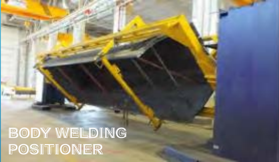
BODY WELDING POSITIONER