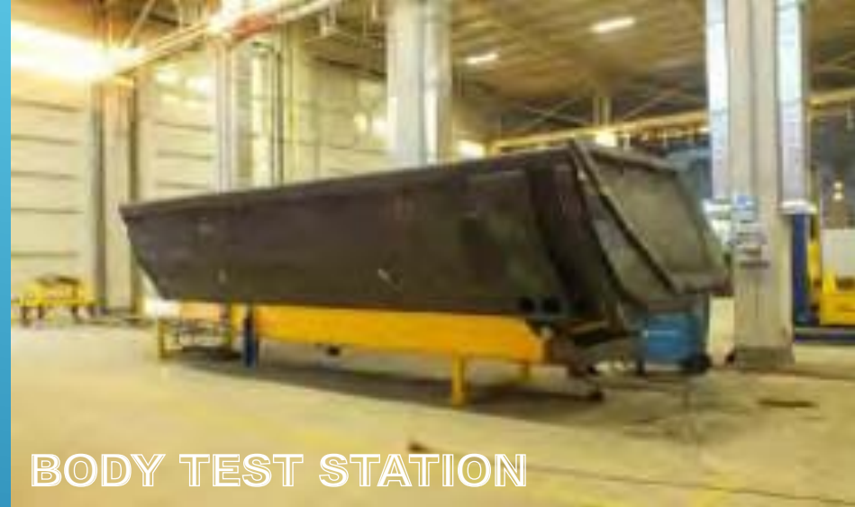
BODY TEST STATION