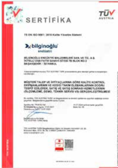
ISO 9001: 2015 Certificate