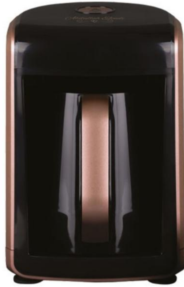
E 199 ECM