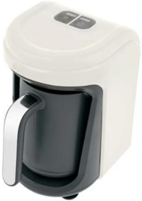
E 242 ECM