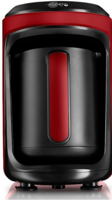
E 163 ECM