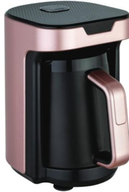
E 187 ECM