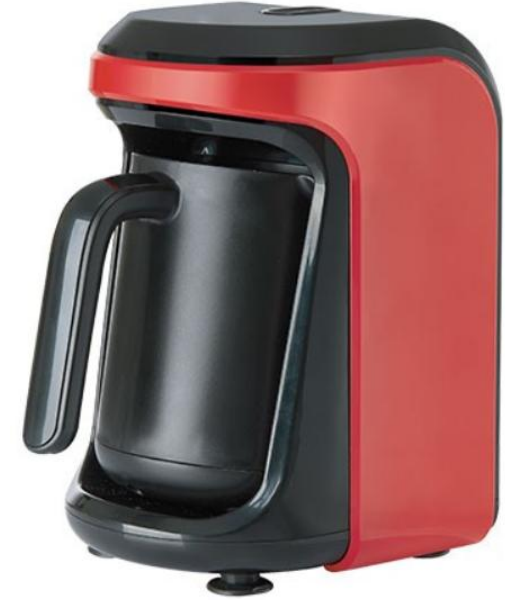
E 194 ECM