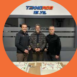
Founders / Board Members