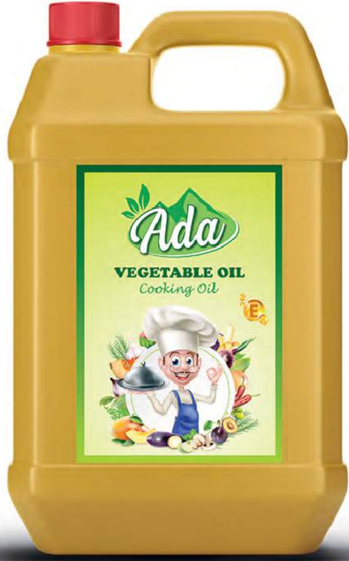
RBD Palm Olein Packaging Jerry Can: 5L