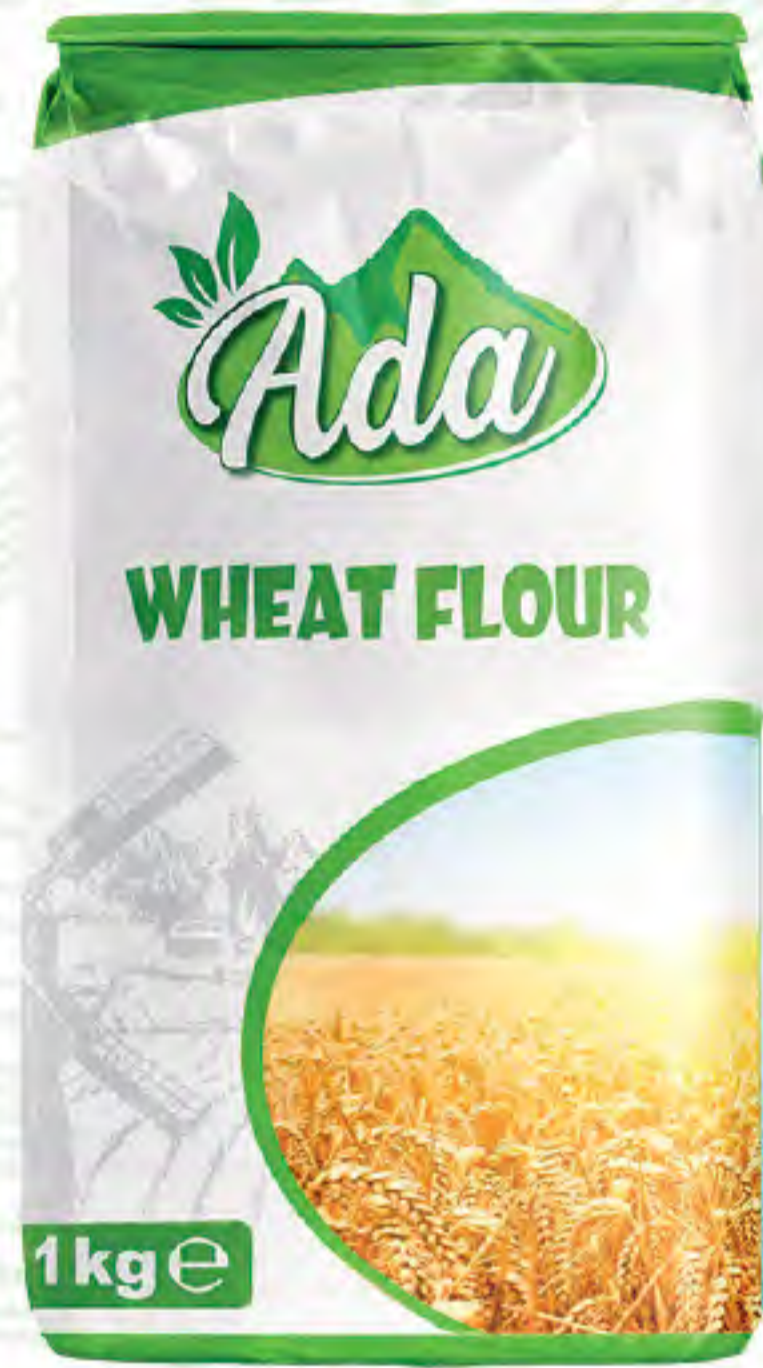
WHEAT FLOUR 1KG