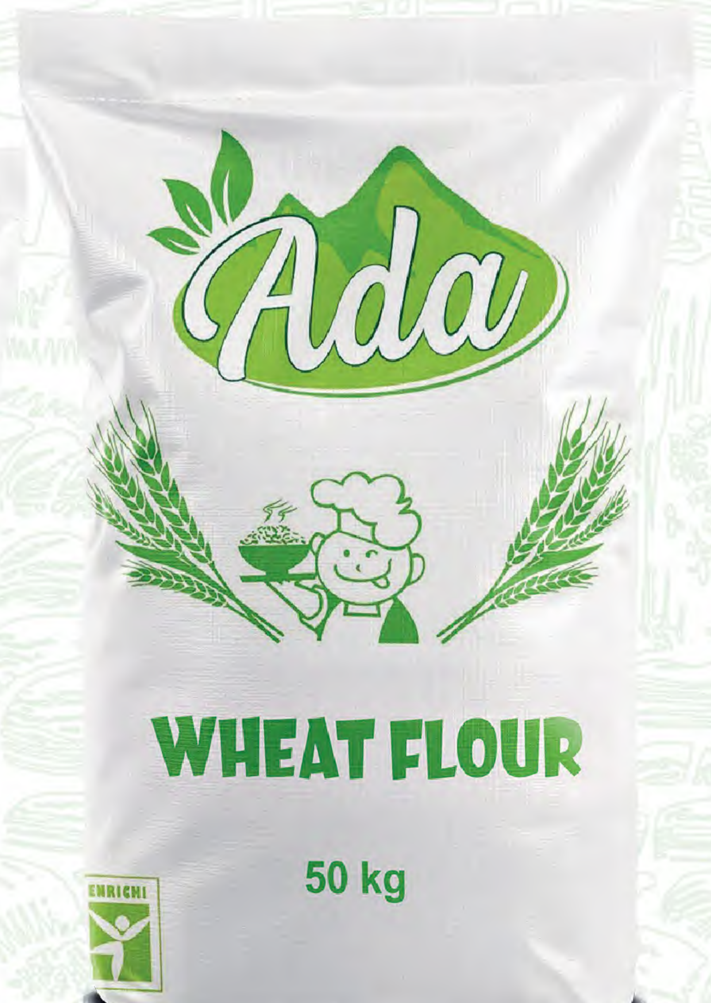
WHEAT FLOUR 50 KG