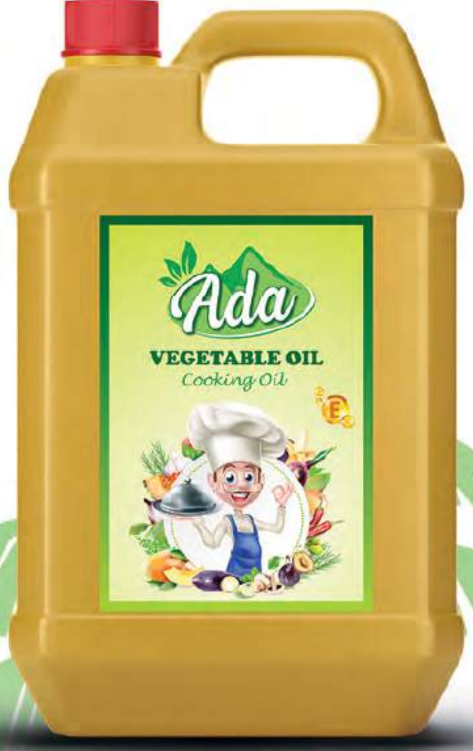
RBD Palm Olein Packaging Jerry Can: 3L