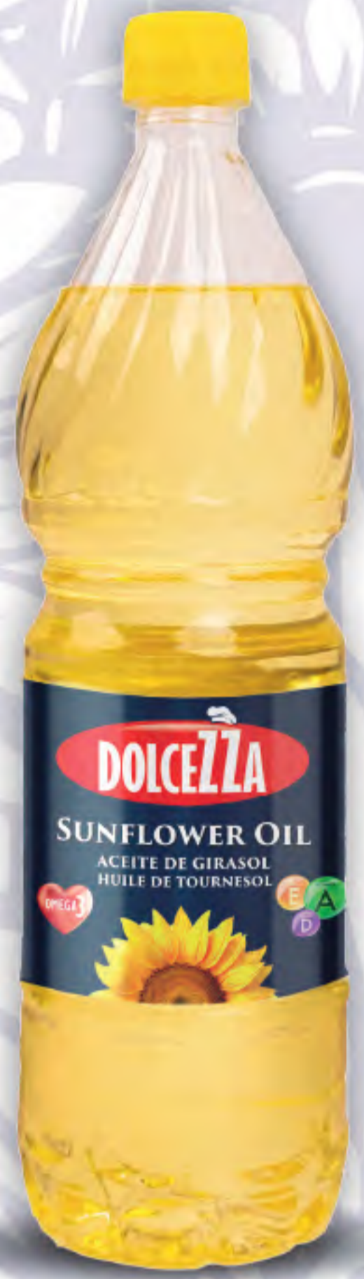
Sunflower Oil 1L