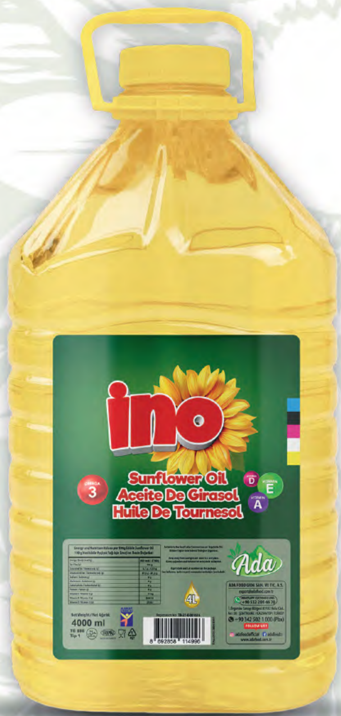
Sunflower Oil 4L