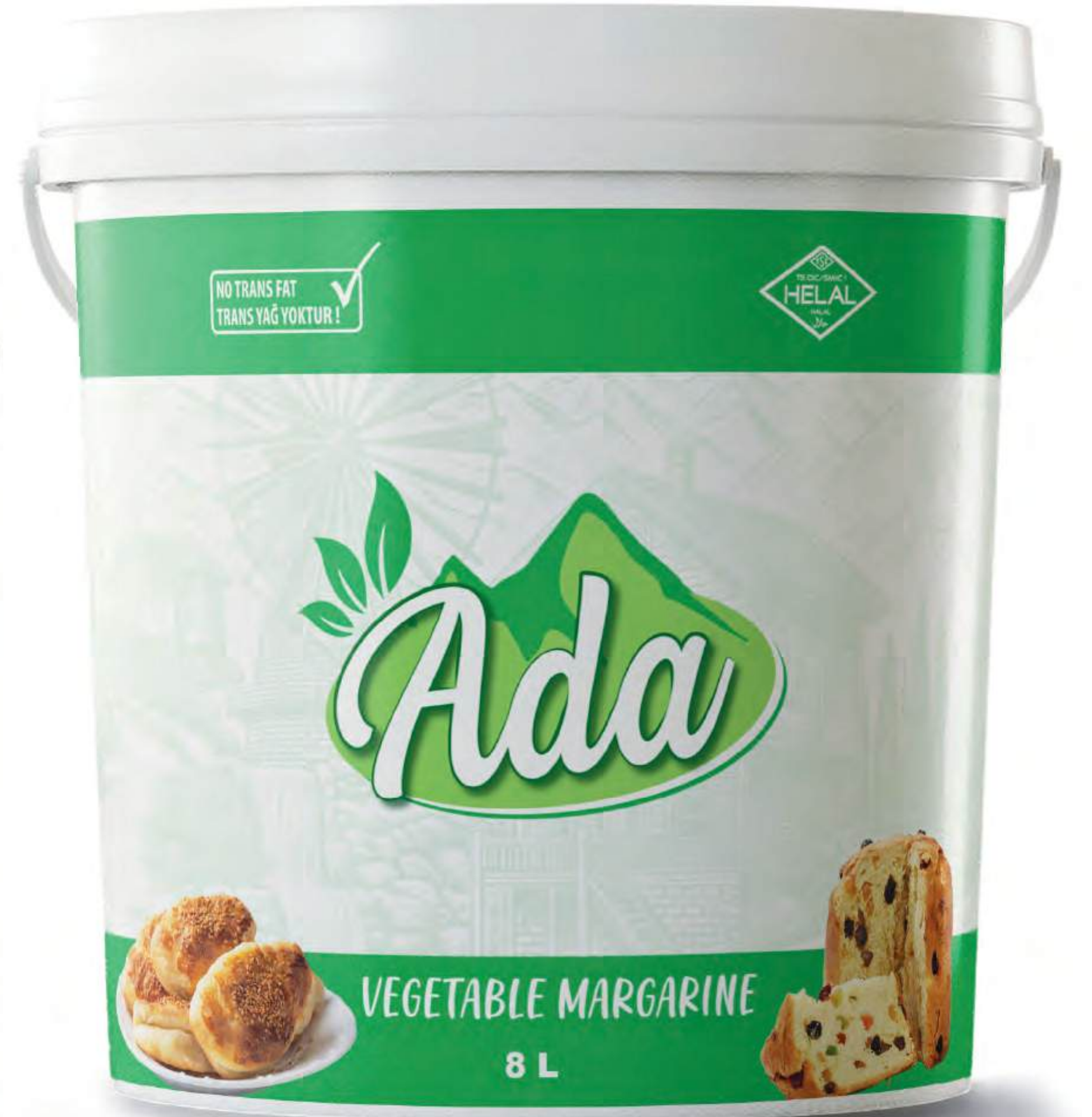
Vegetable Margarine 8 L