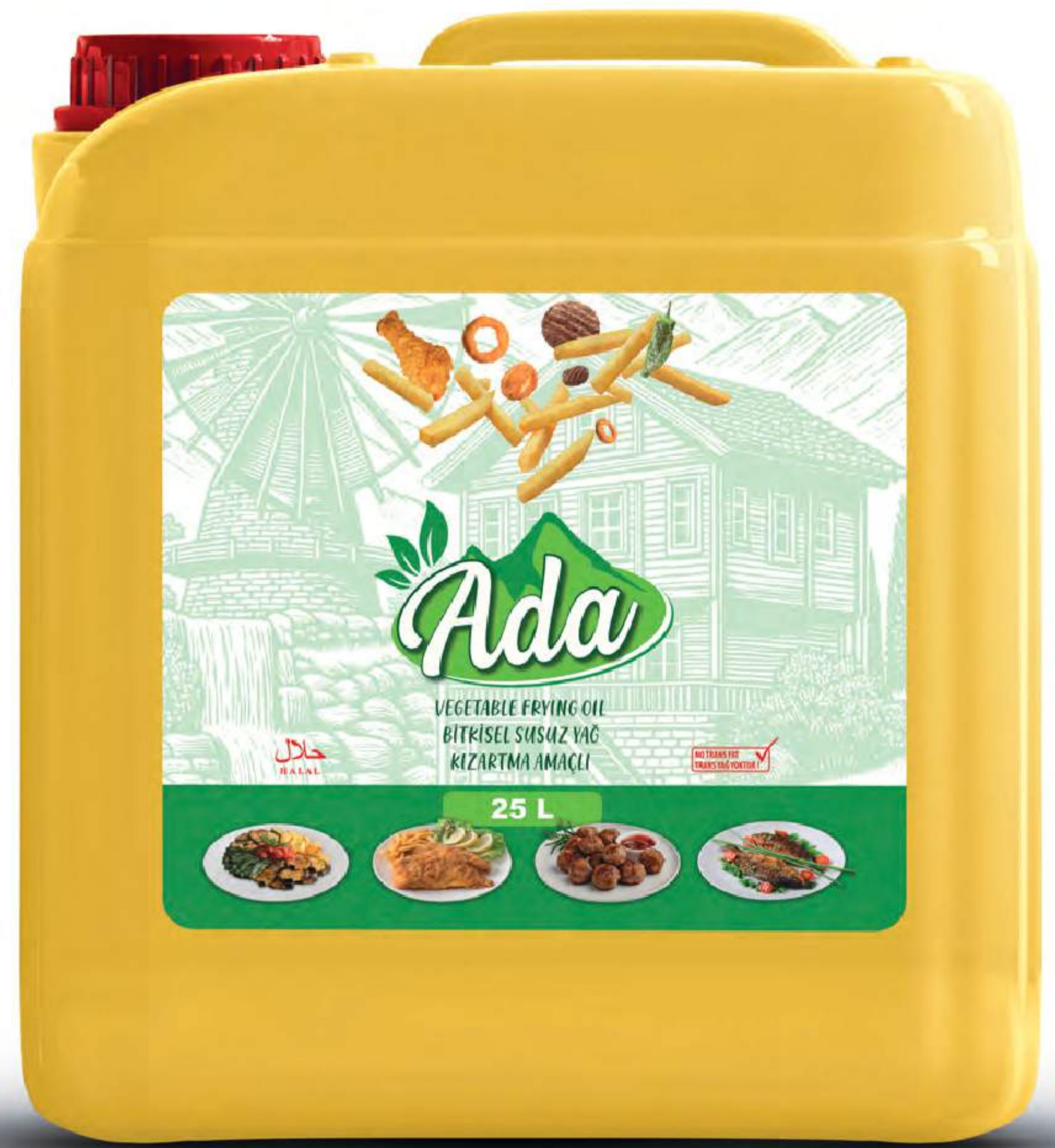
Vegetable Frying Oil 25 L