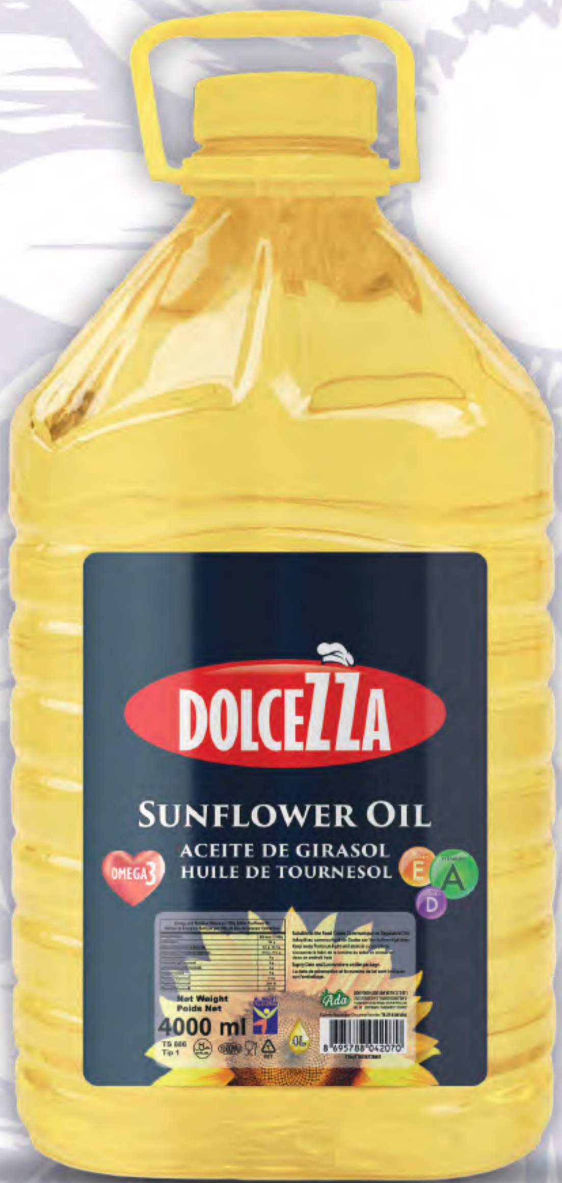
Sunflower Oil 4L