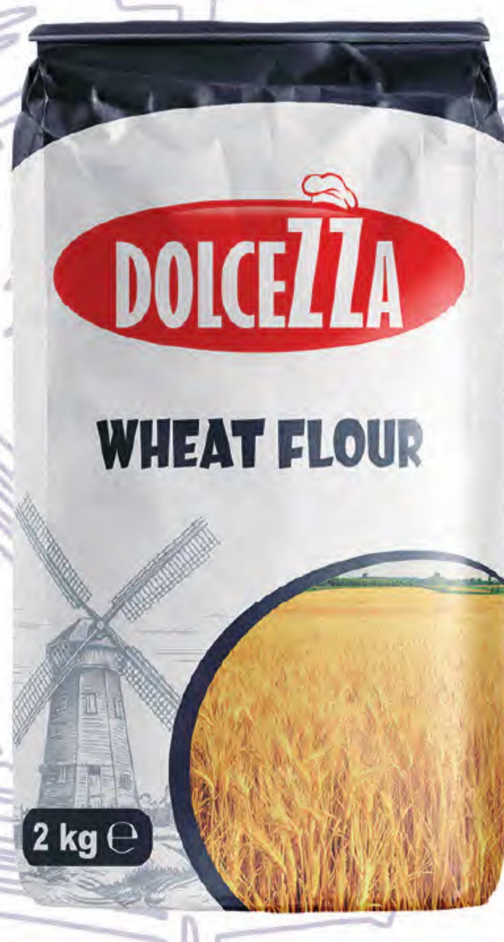
WHEAT FLOUR 2 KG