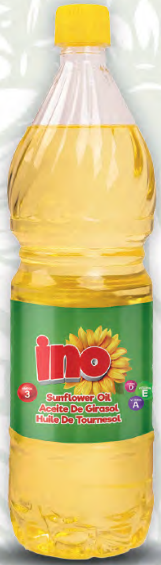
Sunflower Oil 1L