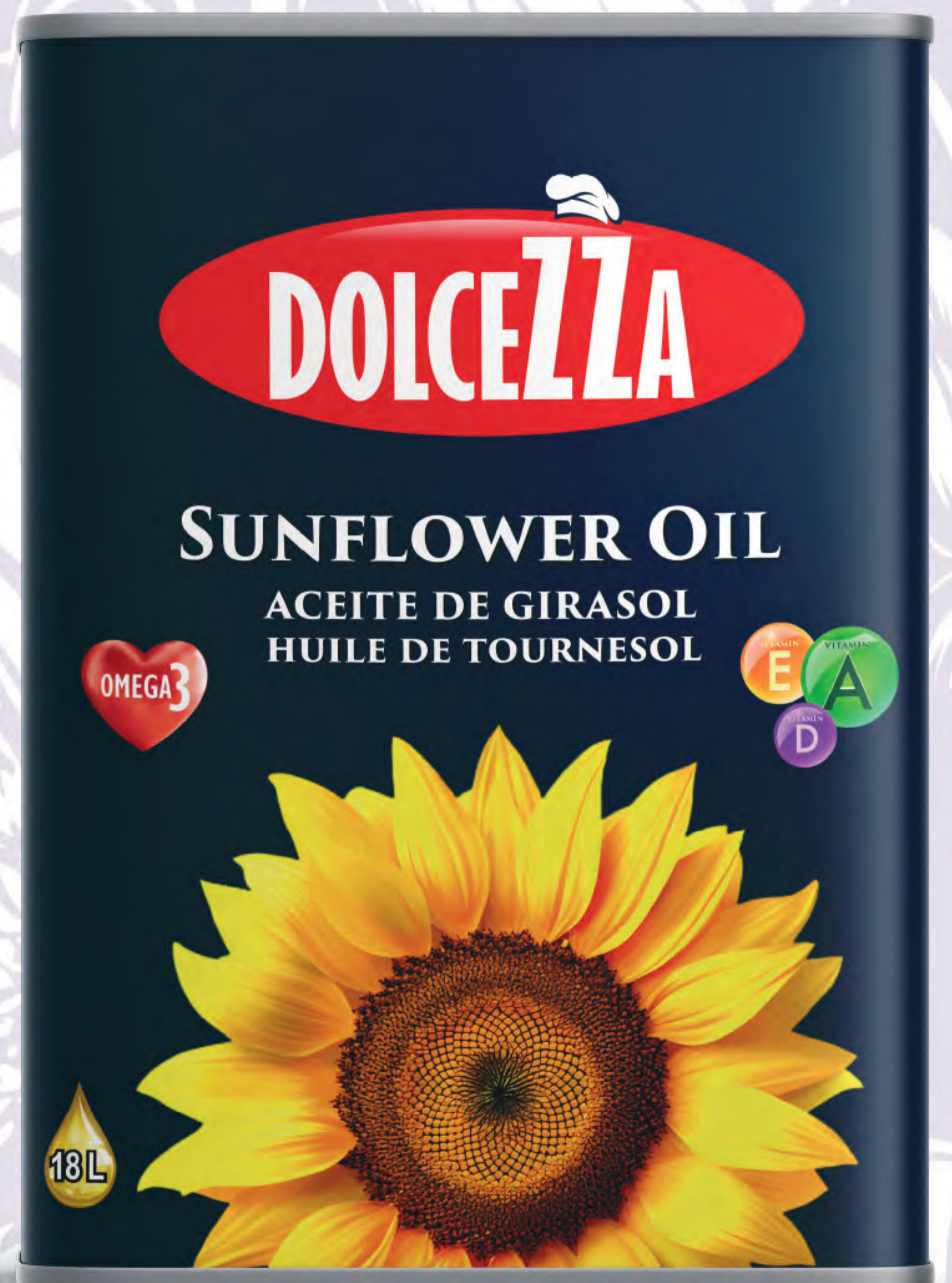
Sunflower Oil 18 L