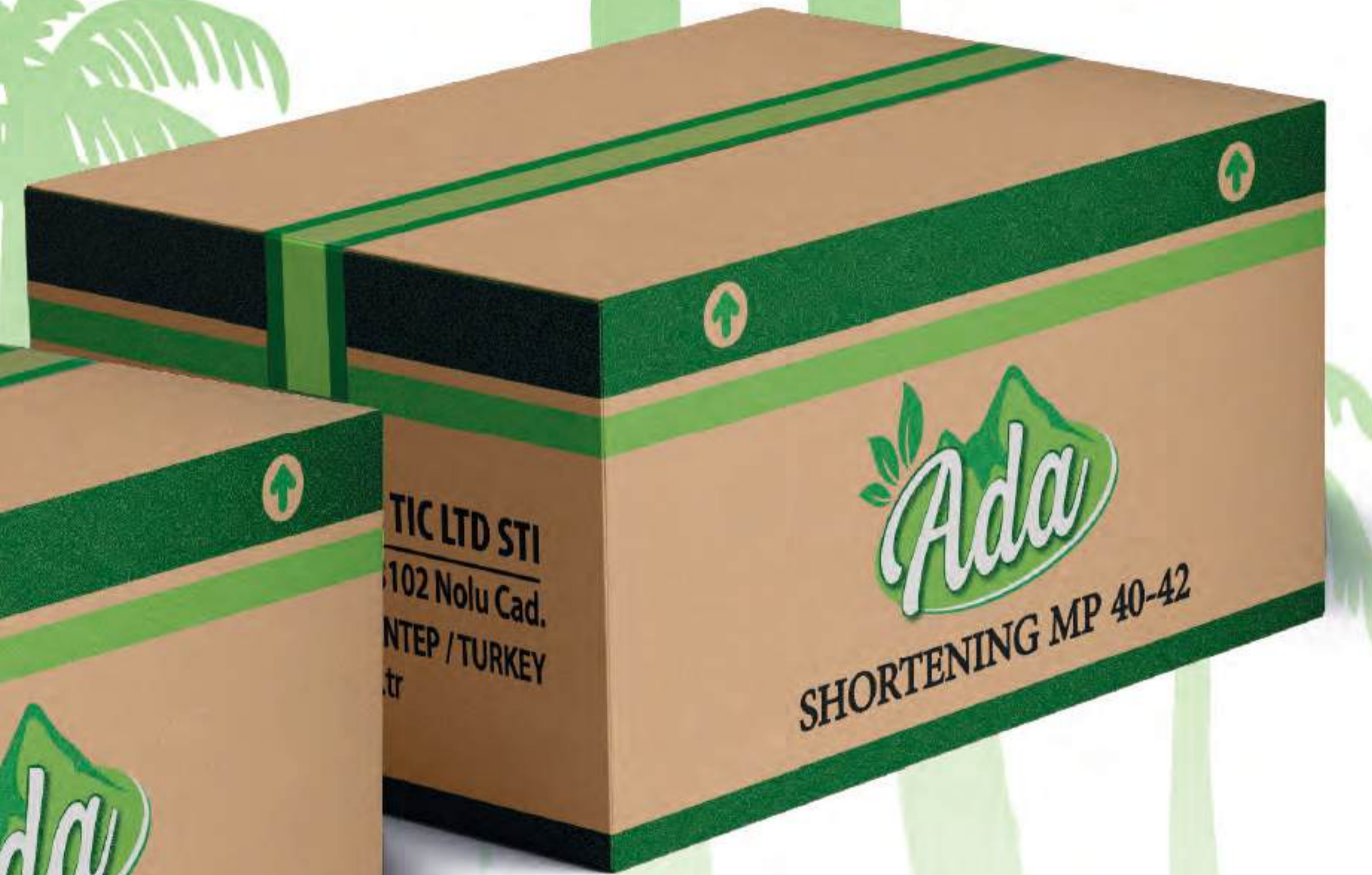
Shortening 40-42 Packaging Carton: 20 kg