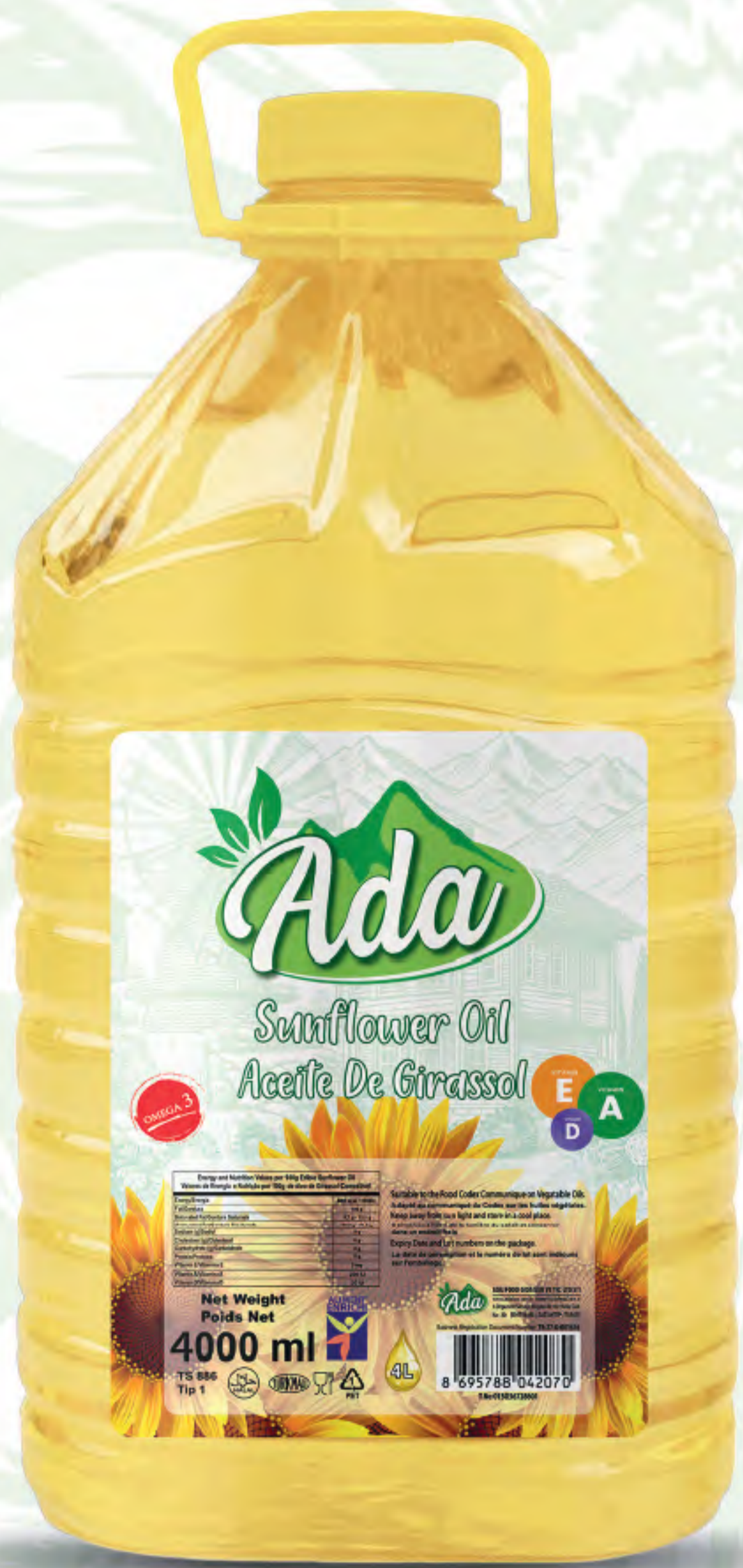
Sunflower Oil 4 L