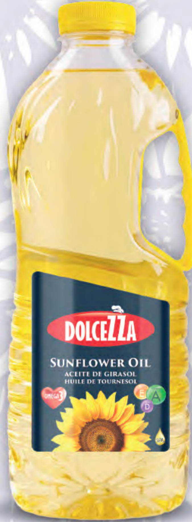
Sunflower Oil 1,5 L