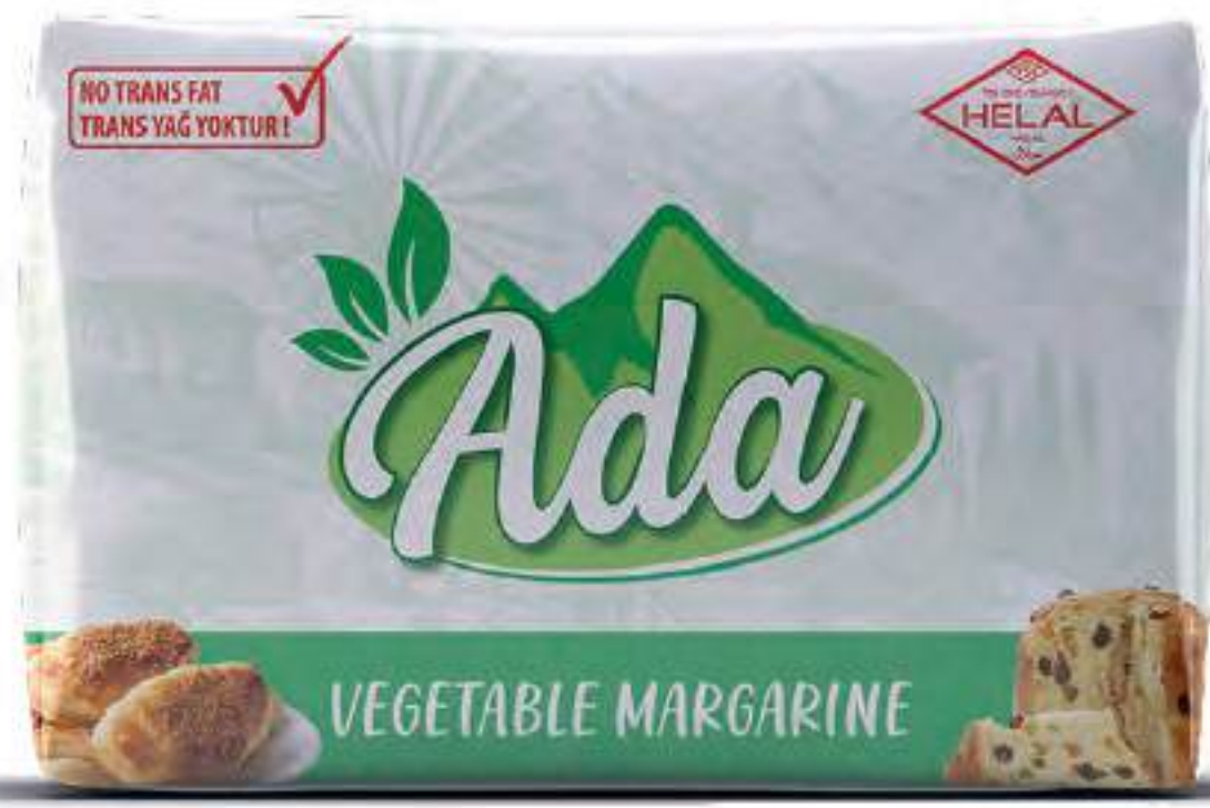
Vegetable Margarine 250 gr