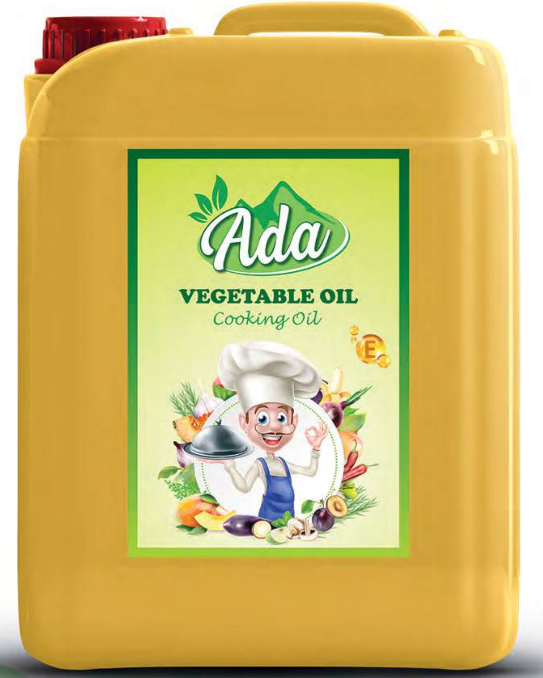
RBD Palm Olein Packaging Jerry Can: 25L