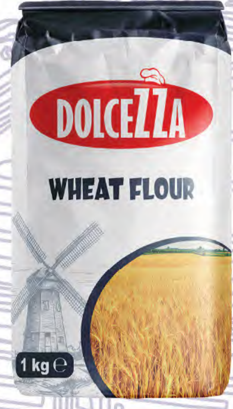
WHEAT FLOUR 1 KG