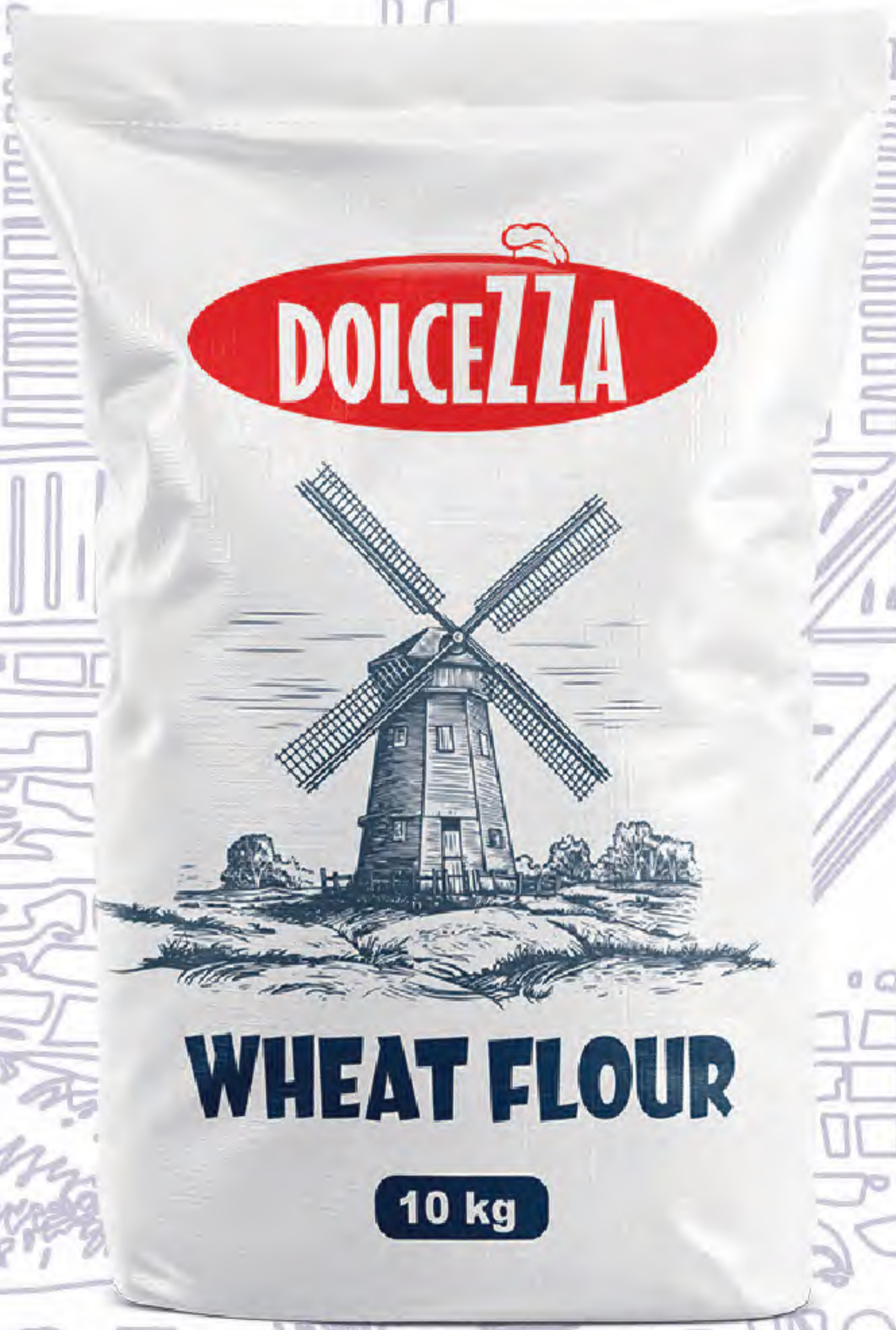
WHEAT FLOUR 10 KG