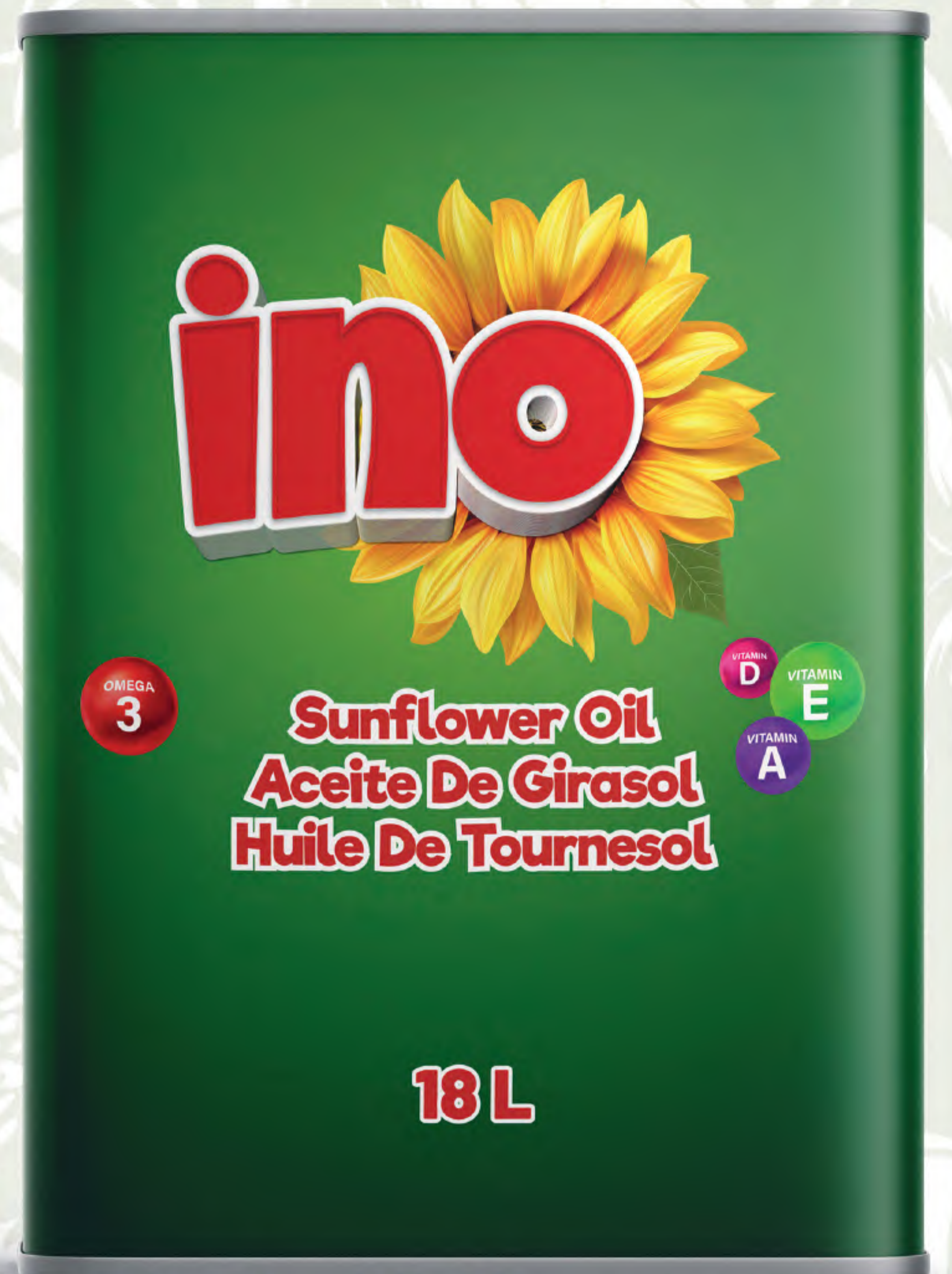
Sunflower Oil 18 L