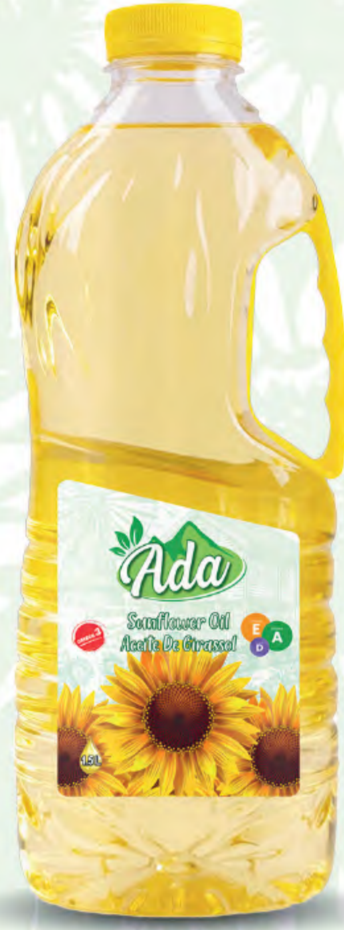
Sunflower Oil 1.5 L