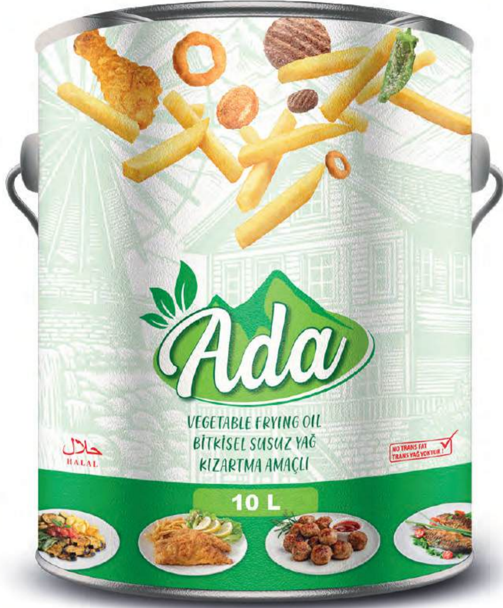
Vegetable Frying Oil 10 L