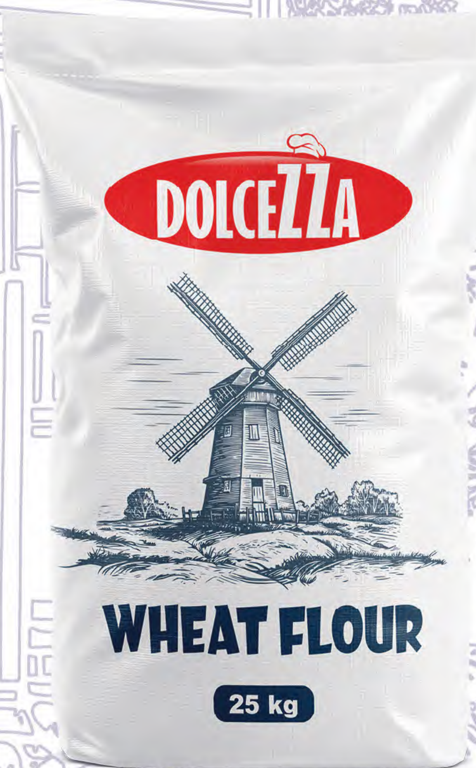
WHEAT FLOUR 25 KG