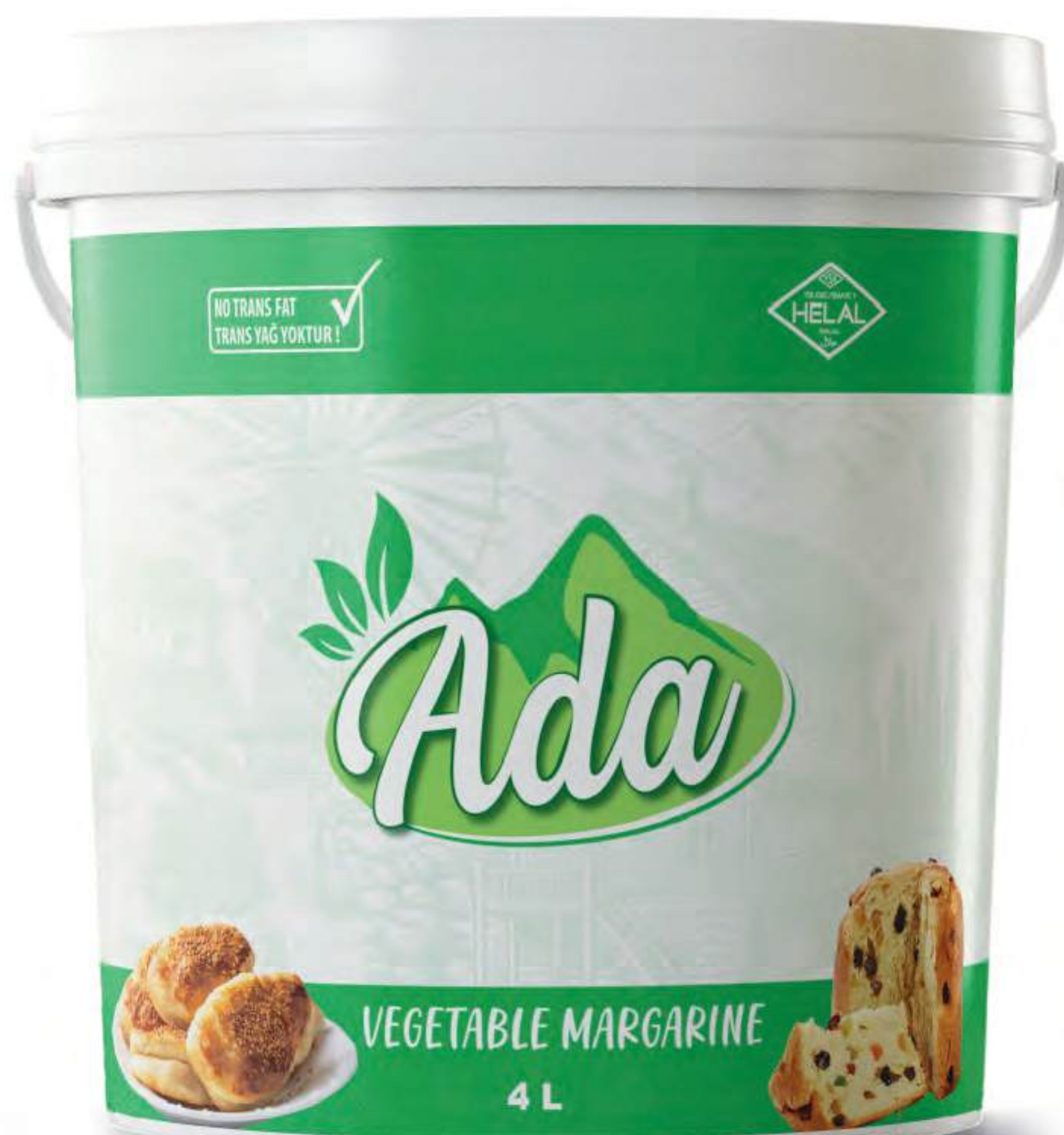
Vegetable Margarine 4 L