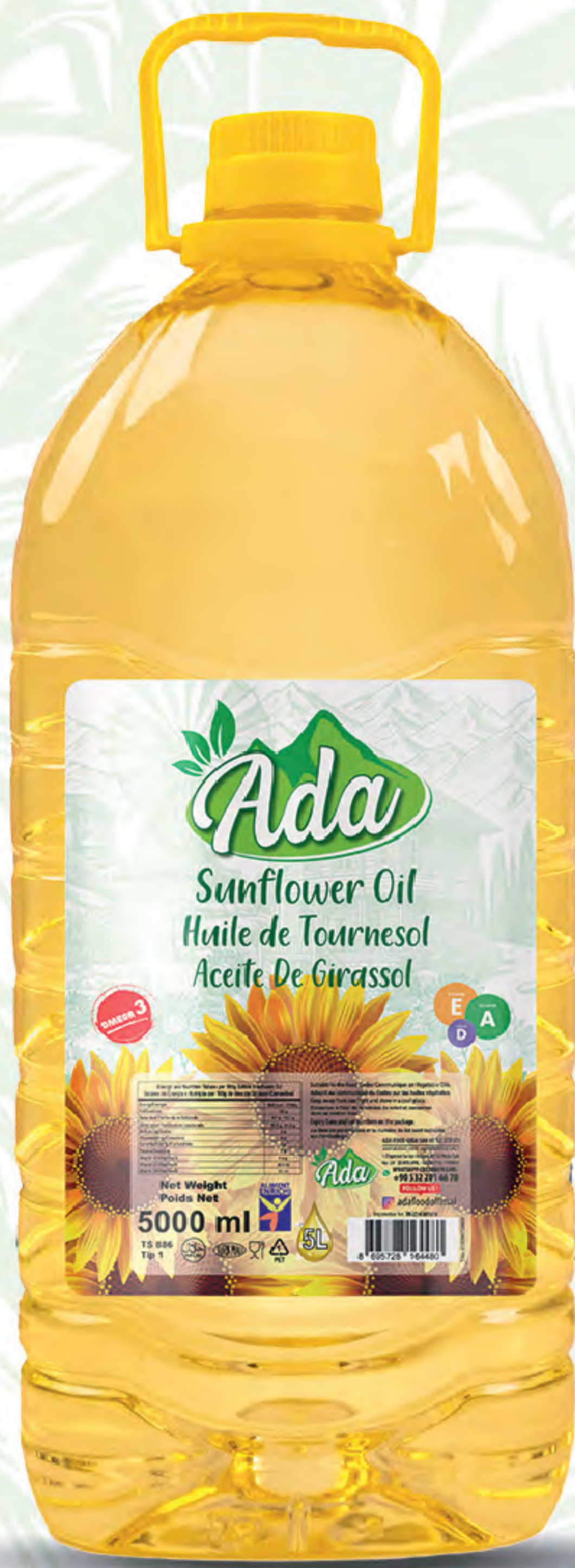
Sunflower Oil 5 L