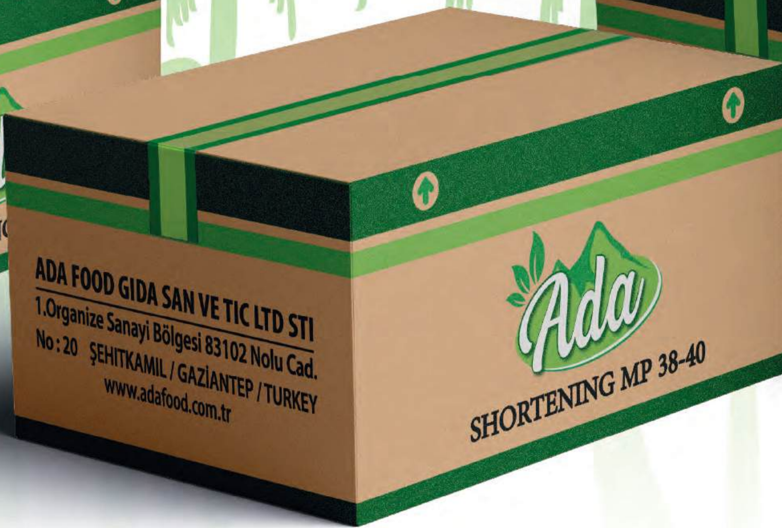
Shortening 38-40 Packaging Carton: 20 kg