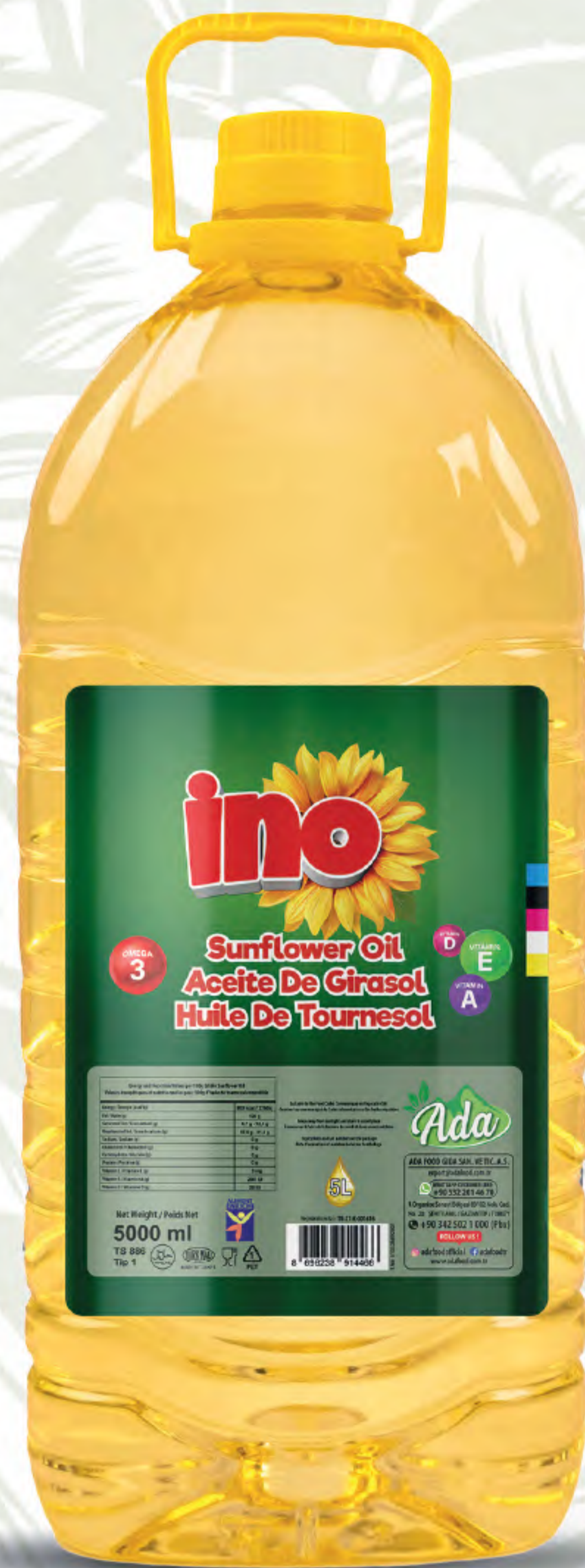
Sunflower Oil 5 L