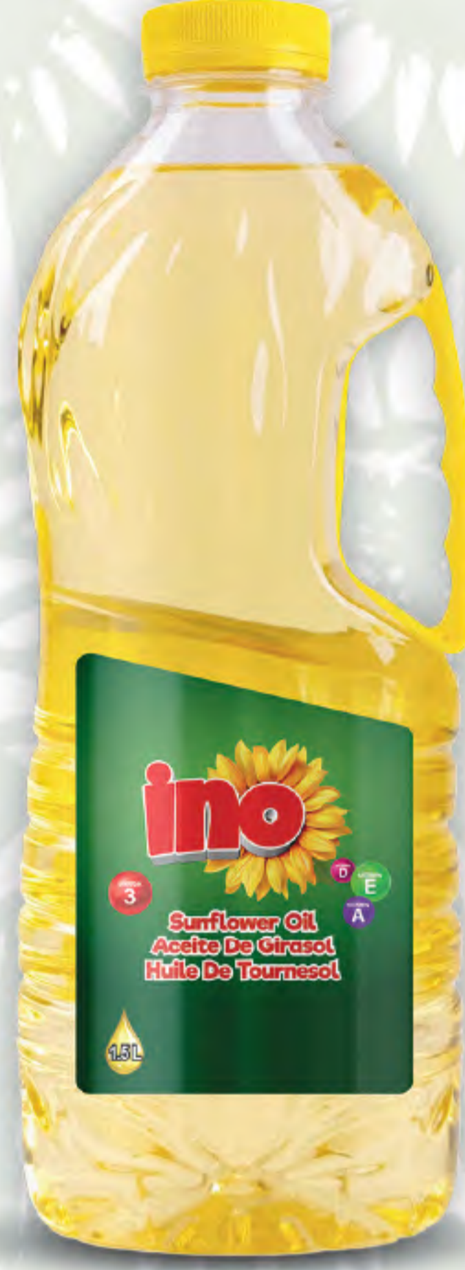
Sunflower Oil 1,5 L