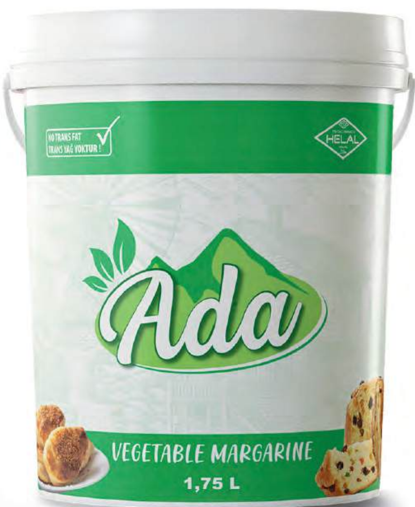
Vegetable Margarine 1,75 L