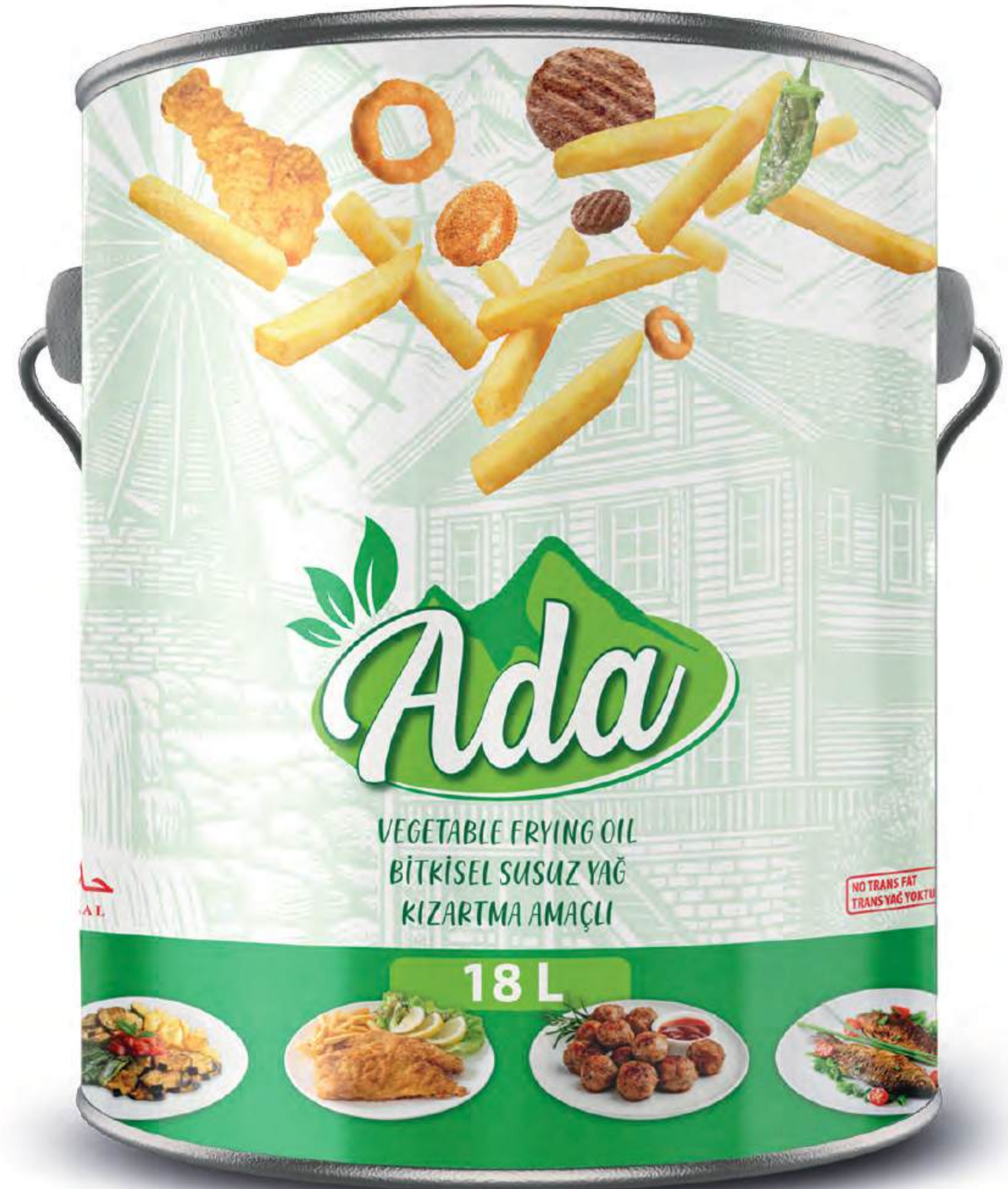
Vegetable Frying Oil 18 L