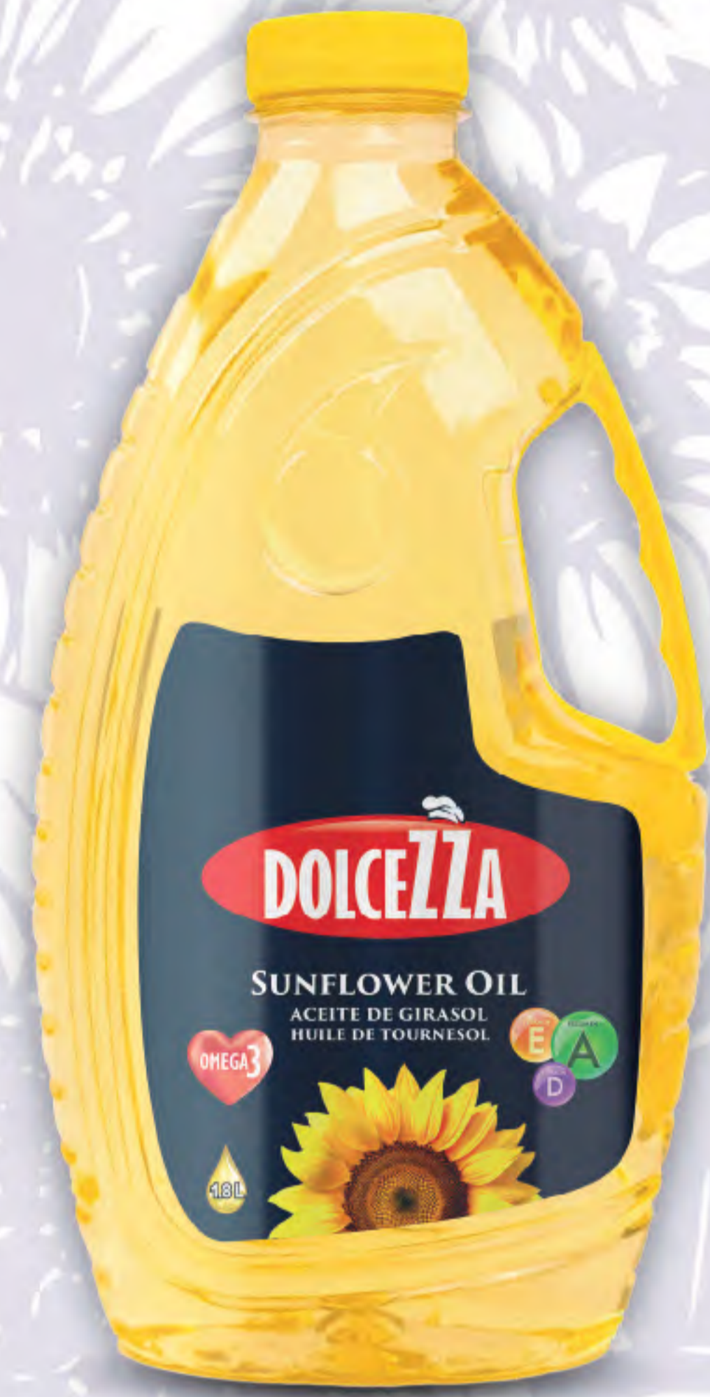
Sunflower Oil 1,8 L