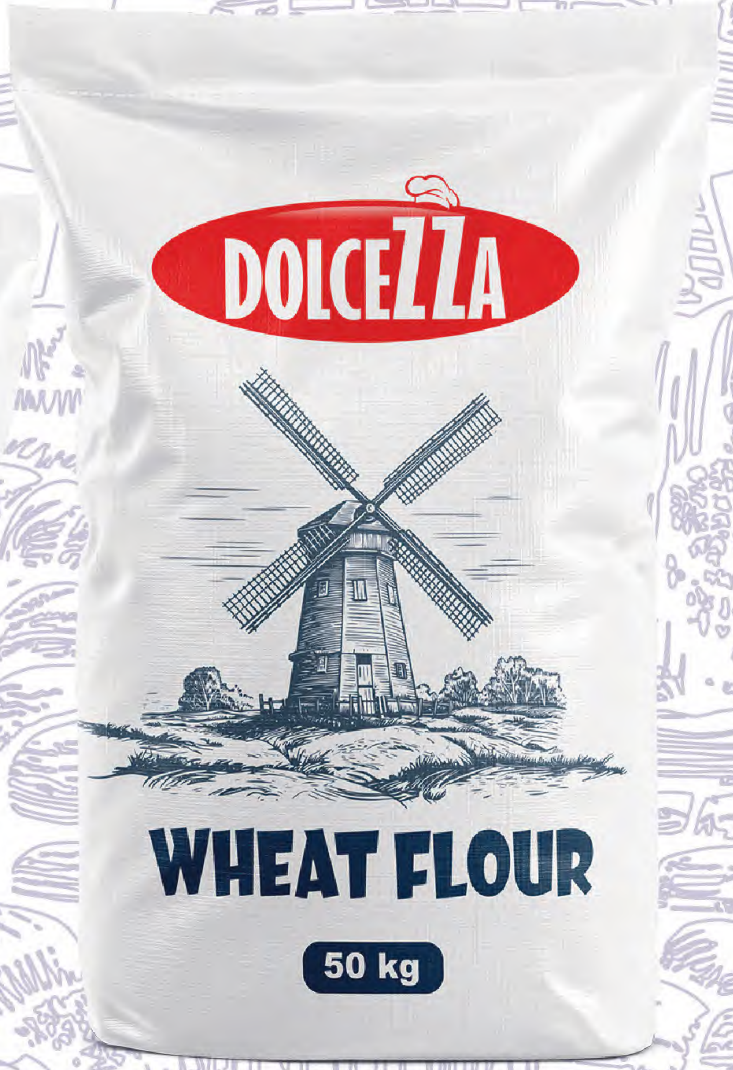
WHEAT FLOUR 50 KG