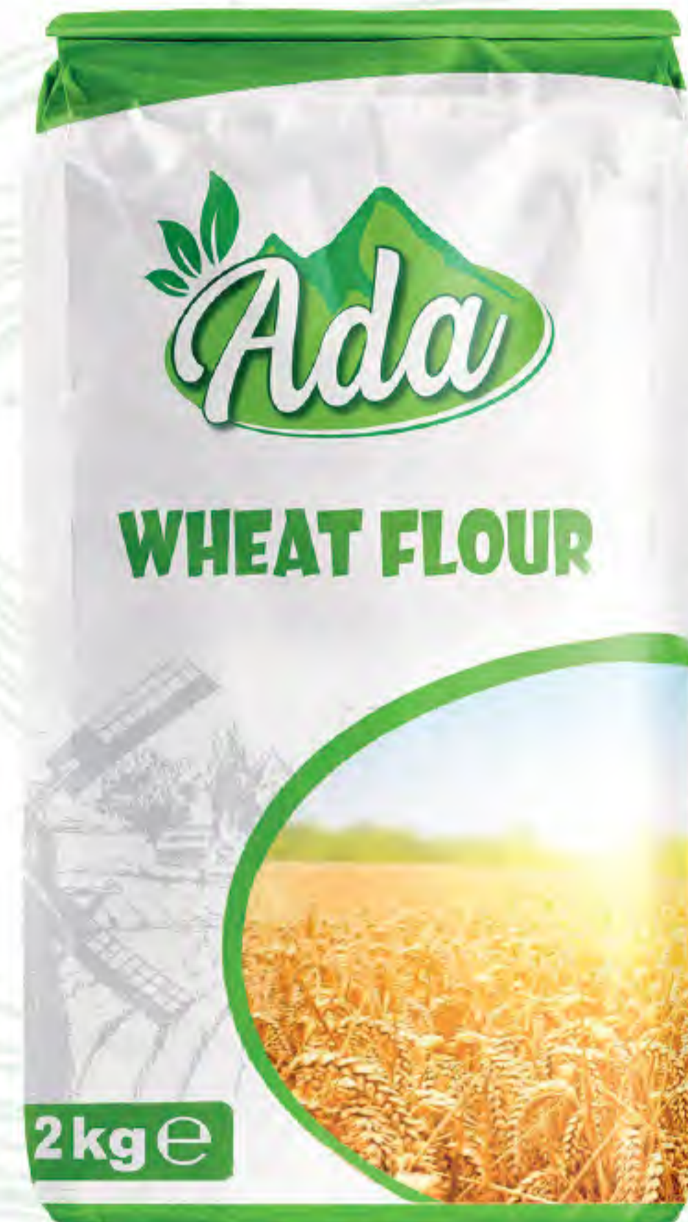
WHEAT FLOUR 2 KG