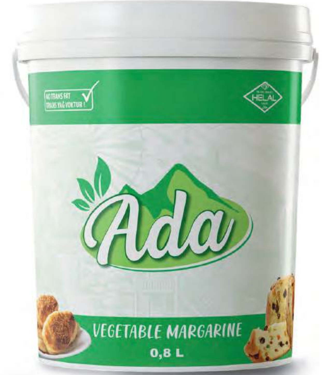
Vegetable Margarine 0,8 L