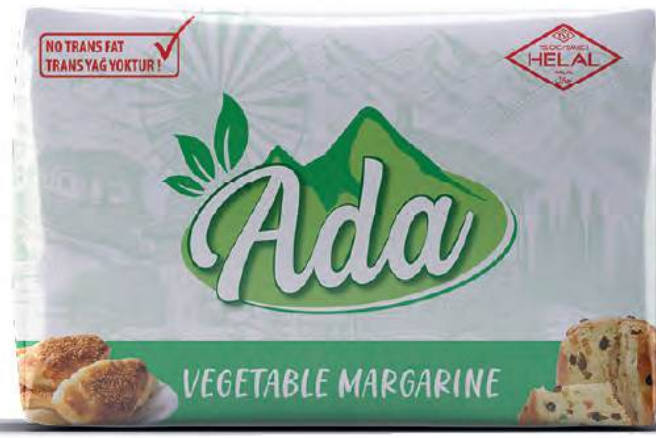
Vegetable Margarine 500 gr