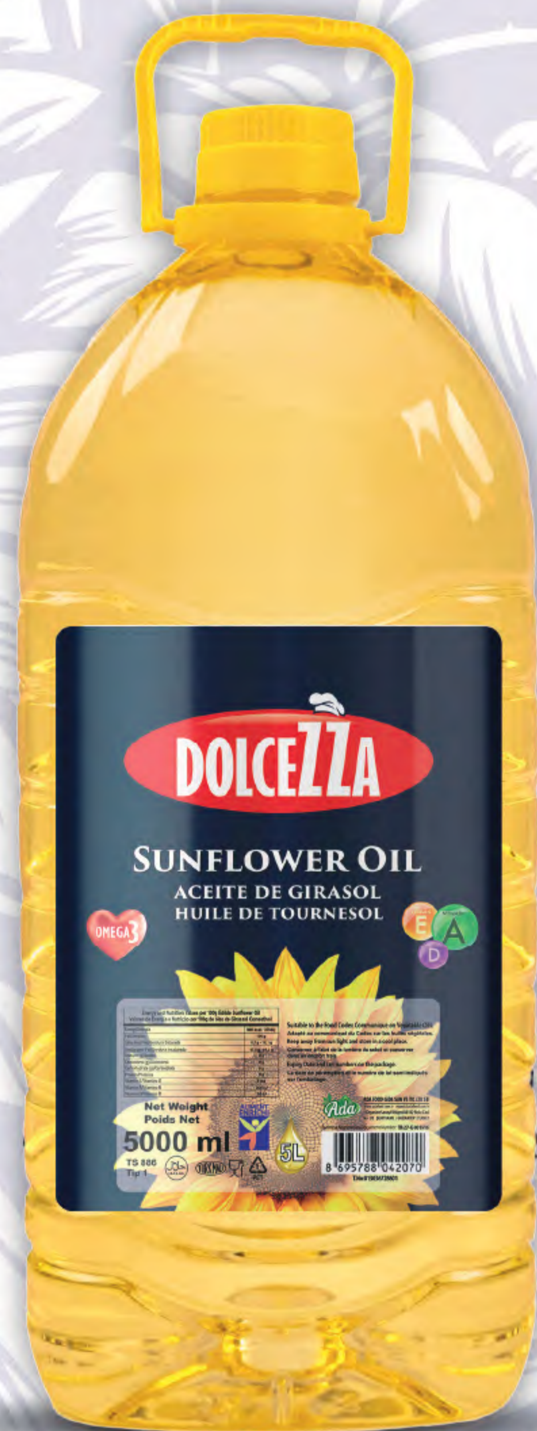
Sunflower Oil 5 L