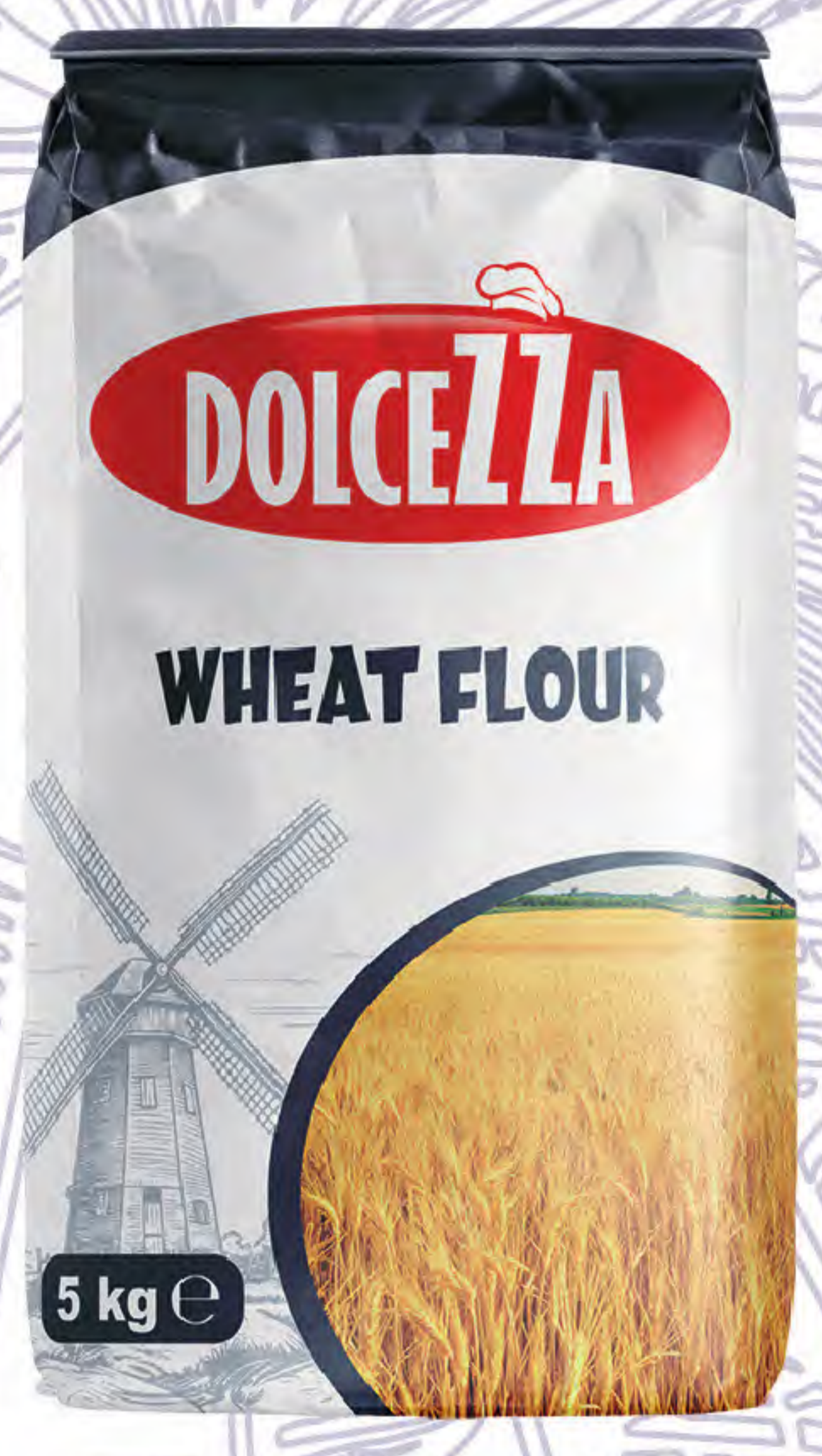
WHEAT FLOUR 5 KG