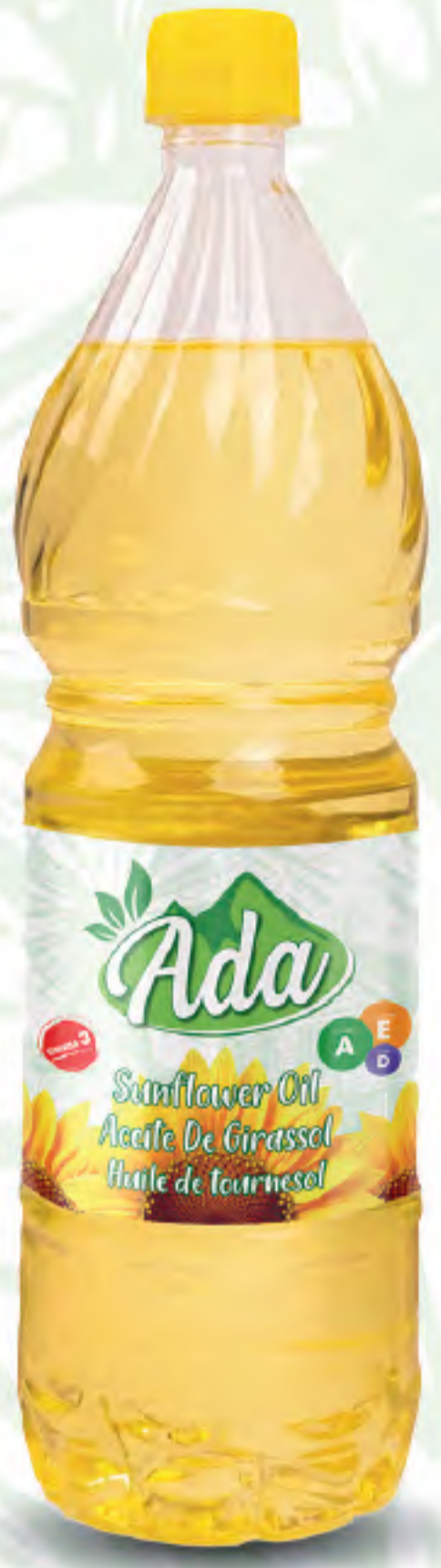
Sunflower Oil 1L