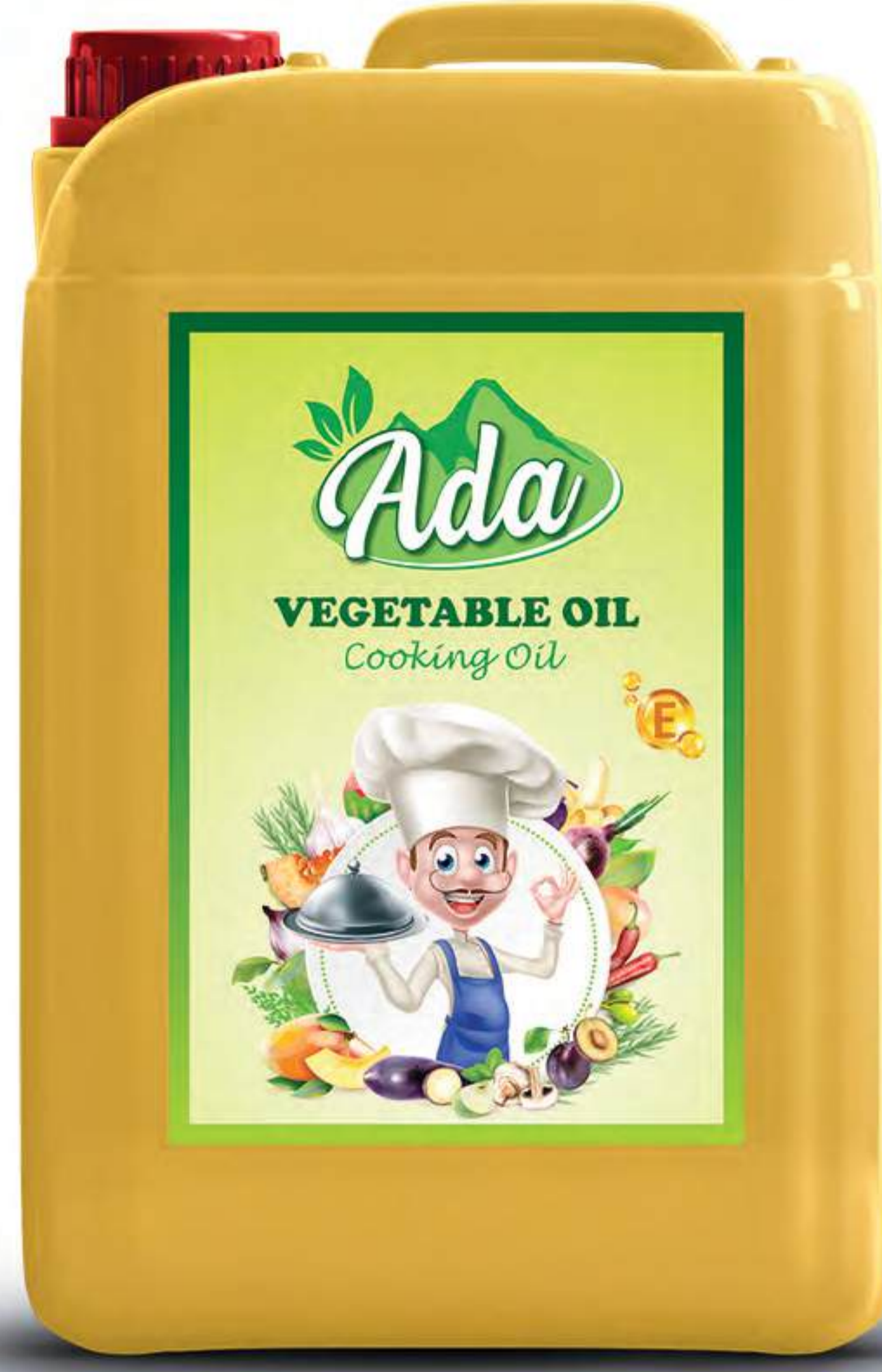
RBD Palm Olein Packaging Jerry Can: 20L