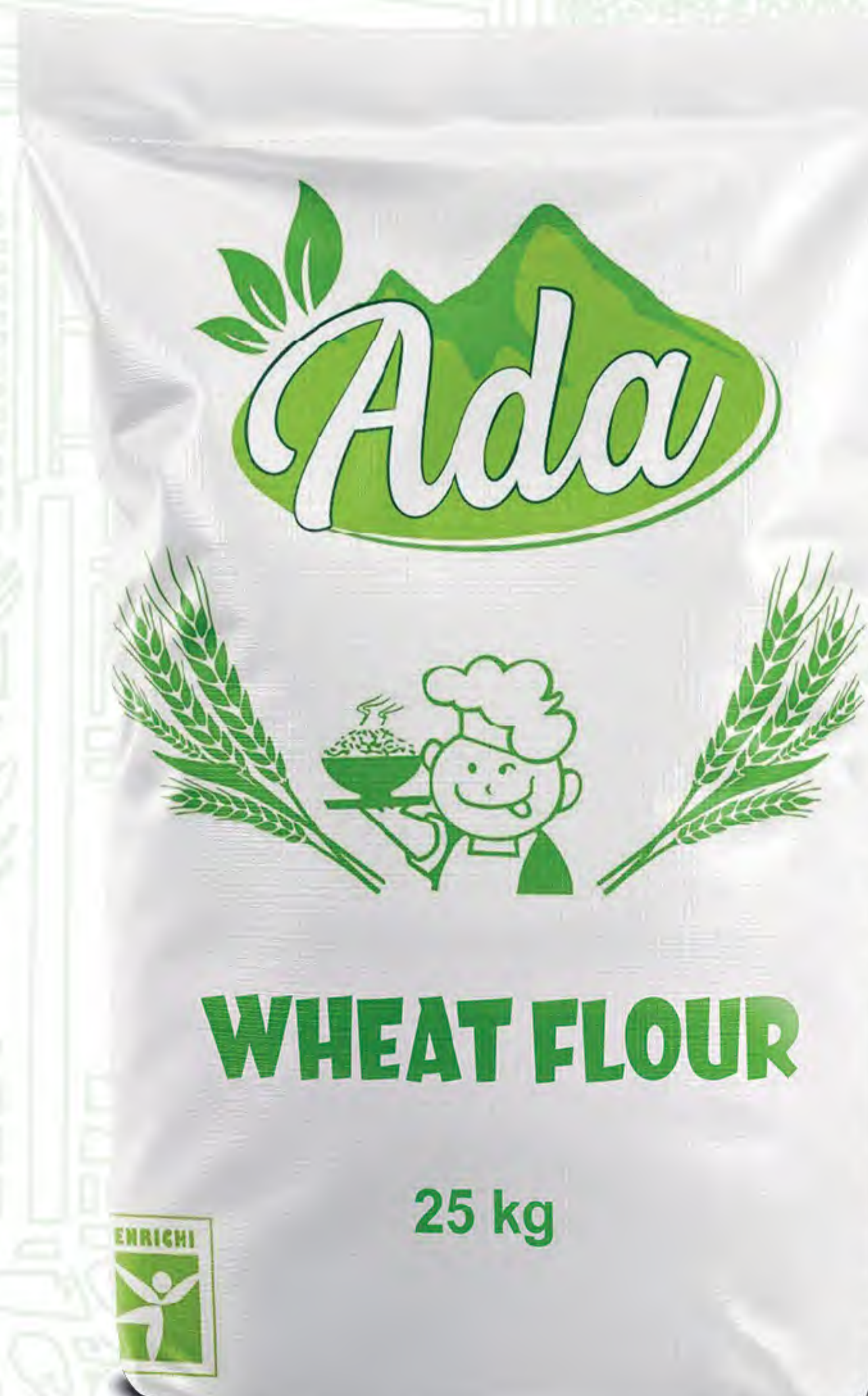
WHEAT FLOUR 25 KG