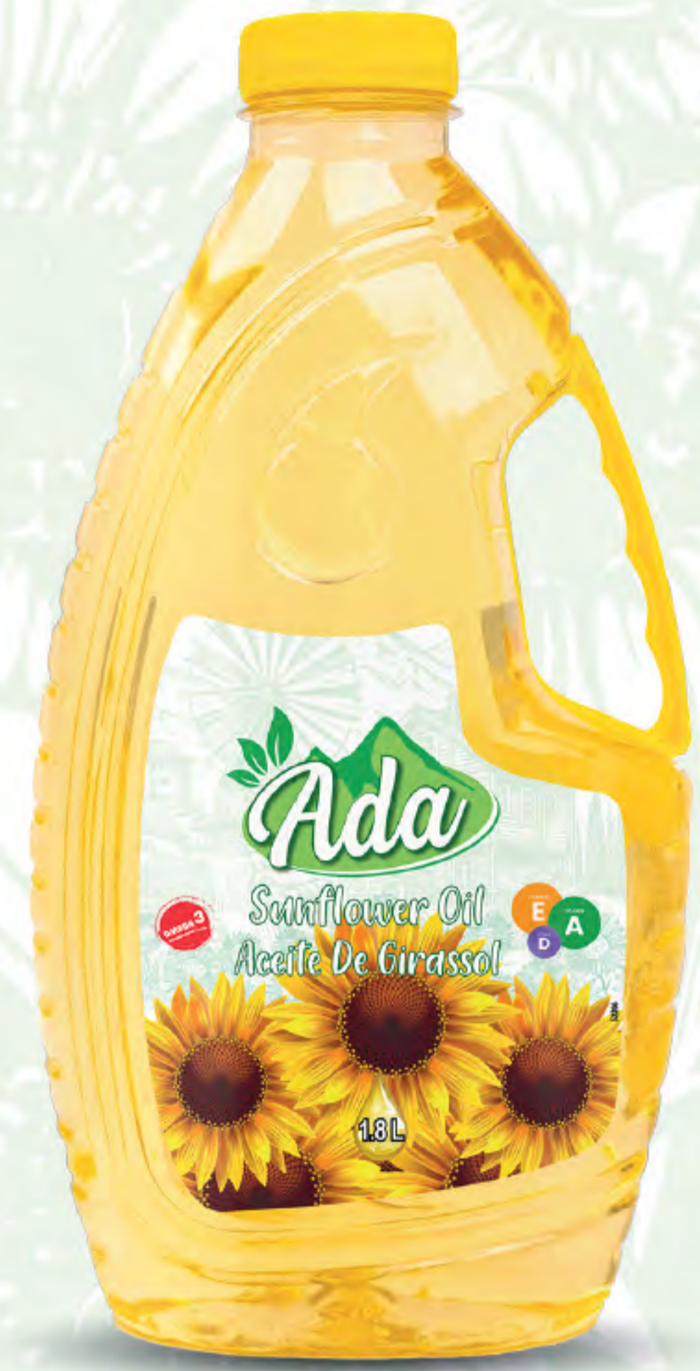
Sunflower Oil 1.8 L