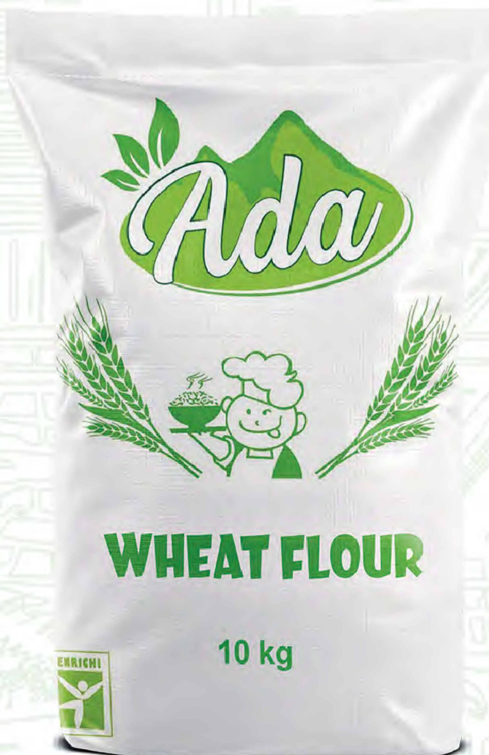
WHEAT FLOUR 10 KG