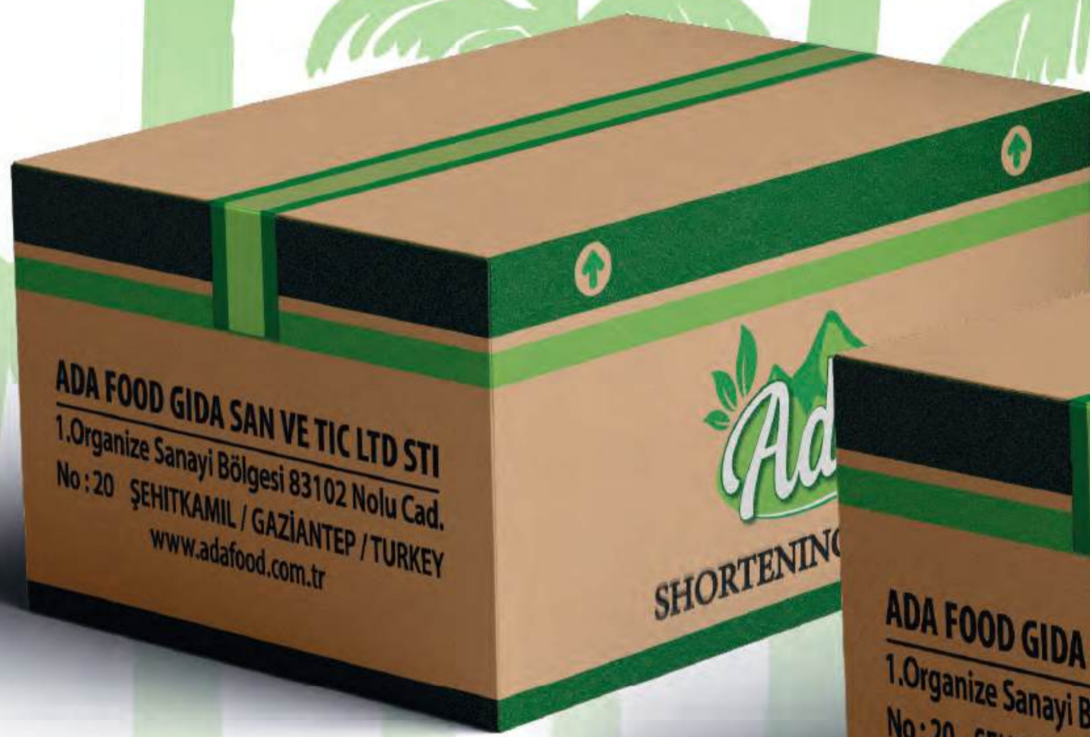
Shortening 36-39 Packaging Carton: 20 kg