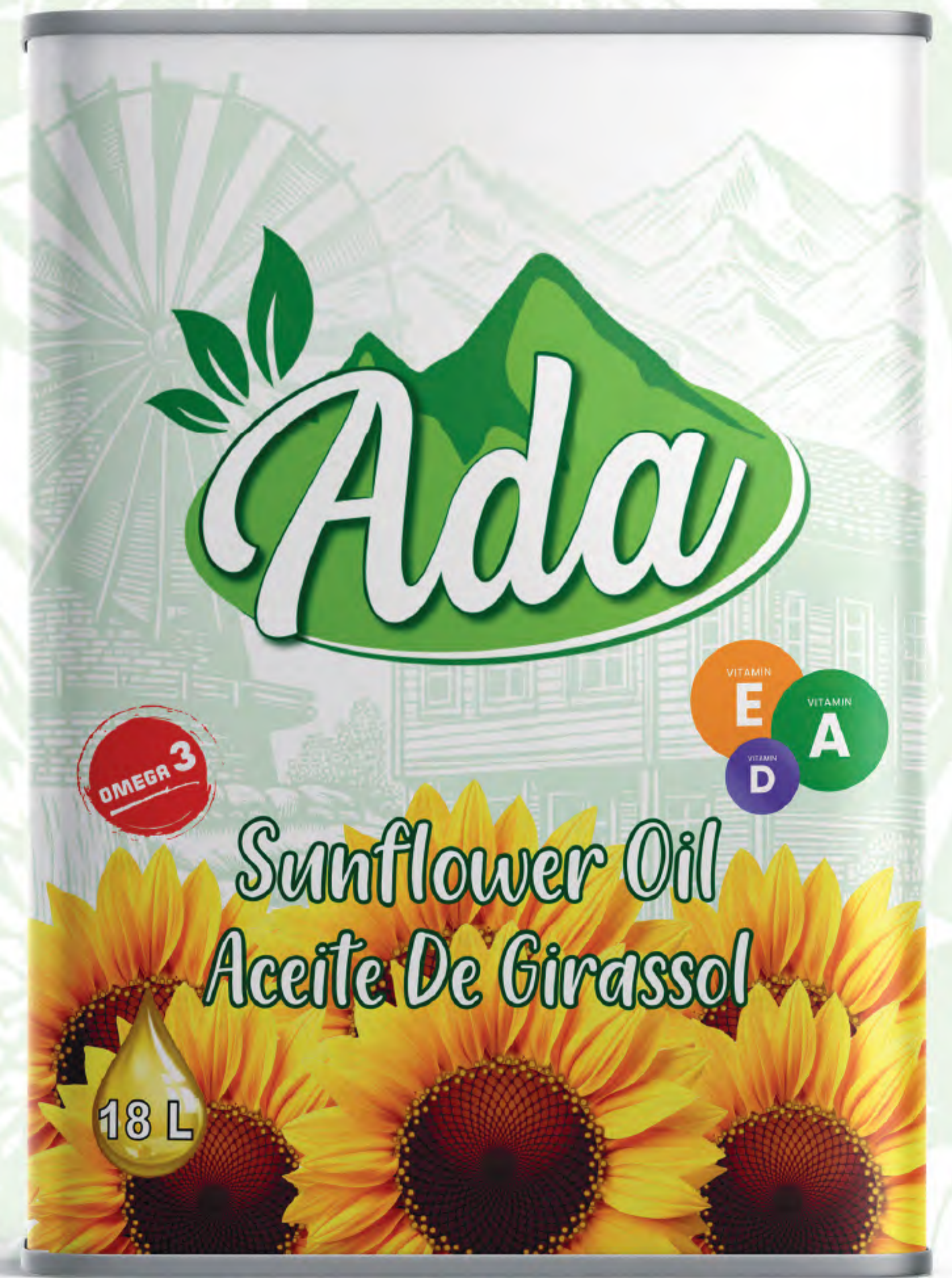
Sunflower Oil 18 L