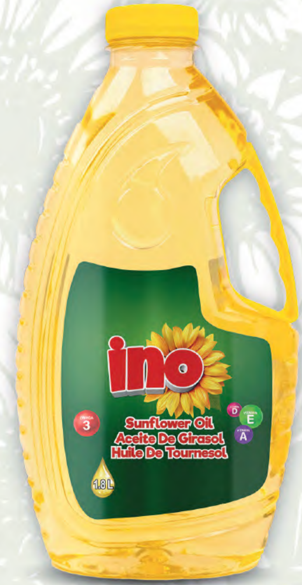
Sunflower Oil 1,8 L