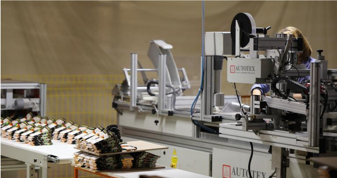
Automatic packaging machine for all types of socks and packing

Automatic sock packaging machines are using to pack without sewing or tagging.